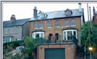
CATERHAM £2200 pcm Stunning character 5 bedroom newly refurbished Victorian house. Lounge. Dining room. Open plan stylish kitchen. Utility room. 4 Bedrooms with ensuite bathrooms. Courtyard garden to rear. Avail Now.