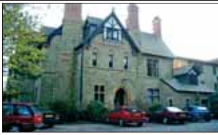
CATERHAM VALLEY £800 pcm Stylish and newly refurbished character 1 bedroom first floor apartment in converted manor house. Large lounge with new bay windows, feature fireplace, and high ceilings. Fully fitted kitchen. Bathroom. Parking. Good location for shops and station. Available now.