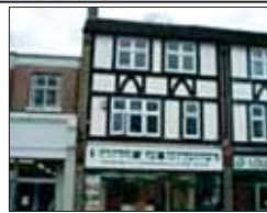
CATERHAM VALLEY £700 pcm Well positioned 1 double bedroom flat in town centre location. Fully fitted modern open-plan kitchen with gas hob, electric oven, fridge/freezer and extractor fan. Spacious lounge. Bedroom with fitted wardrobe. Inclusive of utilities. Available February.