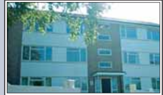
CATERHAM VALLEY £875 pcm Immaculate condition 2 bedroom top floor flat. Brand new fitted kitchen. Spacious lounge. 2 double bedrooms. Views. New Bathroom. Parking & Garage. Available now.