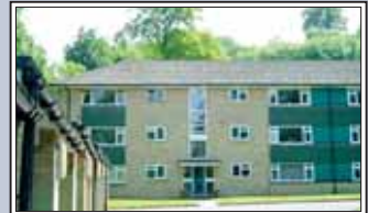
CATERHAM VALLEY £750 pcm Large two double bedroom ground floor flat with fully fitted kitchen and modern bathroom with jacuzzi and shower. Spacious lounge. Double glazed. Garage and Parking. Available now.