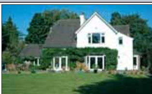
WARLINGHAM £1995 pcm Immaculate 4 bedroom detached property. Large stylish kitchen/breakfast room. Good sized lounge. Dining room/living room. Master bedroom with ensuite bathroom. Family bathroom. Double garage & parking. Garden. Avail Now.