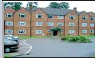
CATERHAM VALLEY £725 pcm Top floor 2 double bedrooms in a quiet, cul-de-sac location with off-road parking. Spacious lounge/dining room. Good-sized, modern fitted kitchen with modern appliances. White bathroom suite with shower. Generous built-in storage. Garden. Available now.