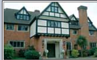
OLD OXTED £1350 pcm Stunning 2 bedroom ground floor apartment. Spacious lounge. Master bedroom with ensuite shower room. Family bathroom. Fitted kitchen. Allocated parking. Avail March Furnished.