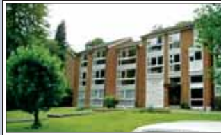
CATERHAM £825 pcm Spacious 2 double bedroom split level apartment in sought after area. Close to town centre & BR. Fully fitted kitchen. Spacious lounge/dining room. Stairs leading to bedrooms & bathroom. Parking. Garage. Available end of February.