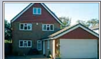
CATERHAM ON THE HILL £2450 pcm Large and spacious 6 bedroom detached house. Large lounge. Dining room. Fully fitted integrated Kitchen/breakfast room. Master bedroom with ensuite shower room. Family bathroom. 2 further spacious bedrooms in the Attic. Garden to rear. Double integral garage and parking. Avail Now.

5 Godstone Road Caterham, Surrey CR3 6RE caterham@martinco.com