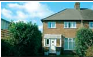
WOLDINGHAM £1200 pcm Spacious 3 bedroom semi-detached house in sought after location. Good sized lounge/diner. Fitted kitchen. Garden with self-contained annex. Parking. Available now.