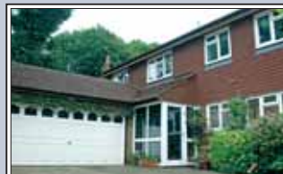
WARLINGHAM £2300 pcm Spacious 5/6 bedroom detached house. Large lounge. Dining Room. Large fully fitted kitchen. Master bedroom with large ensuite. 3 bathrooms. Level garden to rear. Double garage & ample parking. Avail Now.