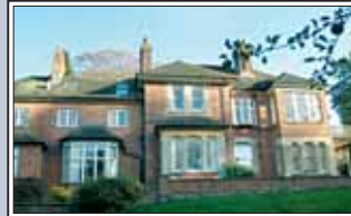
WHYTELEAFE £950 pcm Unique character 2 bedroom apartment in converted manor house. 2 large reception rooms with feature fireplaces and wood panelling. Kitchen & bathroom. Good sized bedrooms. Ample parking. Idyllic surroundings. Available end of February.