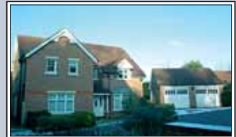
CATERHAM VALLEY £1500 pcm Well presented four bedroom detached house. Two reception rooms. Large fully fitted kitchen with dining area. Lounge. Master bedroom with ensuite shower room. Family bathroom. Double garage and parking. Garden. Avail Now.