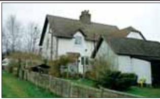
COULSDON £875 pcm In a quiet backwater yet within minutes of Coulsdon town centre and Farthing Downs is this 2 bedroom character semi-detached cottage. Good-sized lounge with coal-effect fireplace. Large kitchen with breakfast area. Front garden, courtyard garden and larger rear garden. OSP for 2 cars. Available now.