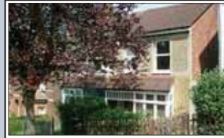
CATERHAM VALLEY £825 pcm Well presented 2 double bedroom semi-detached house within 1 mile of town centre. 2 reception rooms with wood flooring. Fully fitted kitchen. Bathroom. Garden to rear. Available now.