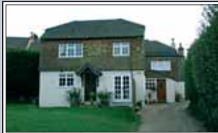
CHALDON £1300 pcm Character 3 bed semi-detached property in quiet location down country lane. Spacious lounge with beamed ceiling and wood burning fire. Large fully fitted kitchen. 3 double bedrooms all with fitted wardrobes. Office room. Garden. Parking for several cars. Available now.