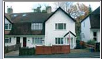
OLD COULSDON £1100 pcm Newly refurbished 3 bedroom end of terraced house. Fully fitted new kitchen. 2 bathrooms. Front and rear gardens. Off street parking for one car. Available now.