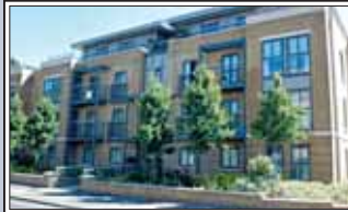
CATERHAM £925 pcm Newly built stylish 2 bedroom first floor apartment within easy walking distance of Caterham town centre and train station. Lounge with balcony. Modern de-luxe fitted kitchen. Master bedroom with ensuite shower room. Family bathroom. Underfloor heating. Avail Now.