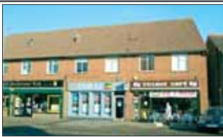
WARLINGHAM £625 pcm 1 double bedroom flat above shop premises just off Warlingham Green. Lounge. Modern kitchen. Bathroom. Available end February.