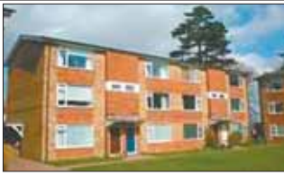
Caterham £850 pcm

Character 1 bedroom apartment in Victorian property in sought after location. Large lounge with original features and wooden flooring. Fully fitted kitchen. Stylish bathroom. Spacious bedroom. Parking. Avail unfurnished