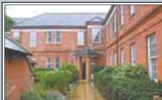
Netherne Village £1250 pcm

Well presented 3 bedroom semi-detached house in quiet cul de sac position within easy access of A22, By-pass and M25. Spacious lounge. Fitted kitchen. Level mature garden to rear. Garage and off street parking for two cars. Avail unfurnished