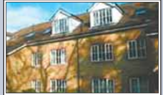
Whyteleafe £900 pcm

Very attractive and spacious 4 bedroom town house set over three floors in convenient position. Modern kitchen with integrated appliances. Cloakroom. Versatile living accom as can be set up as 3 bedroom with lounge and dining room or a 4 bedroom family house. Avail unfurnished