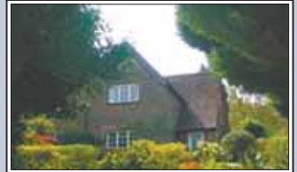
Godstone £975 pcm

Conveniently located fully furnished 2 bedroom apartment within minutes walk of Whyteleafe and Upper Warlingham train stations. Good sized lounge. 2 double bedrooms. Fully fitted kitchen. Avail furnished.