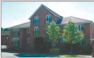
Caterham Valley £925 pcm

Very attractively presented 2 bedroom ground floor maisonette in quiet location. Large lounge with dining area. Parquet flooring. Modern fitted kitchen and bathroom with shower facility. Garage and visitor parking. Avail furnished or unfurnished