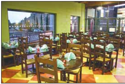
The stylish setting of Aldo@theArc where diners can enjoy a classic view of Caterham's military heritage.

When dining there recently, I decided to try something new for starters and chose Grilled Aubergines in a bed of tomato sauce served with rocket salad and parmesan