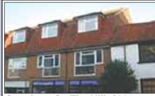
Caterham On The Hill. £825 pcm

Conveniently located newly refurbished ground floor maisonette close to town centre, shops and station. Brand new kitchen and bathroom. Main double bedroom and smaller second bedroom/office. One allocated parking space. Avail unfurnished