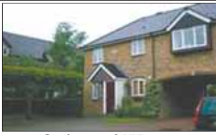
Godstone £675 pcm

Newly decorated & spacious first floor 1 bedroom flat with own entrance in convenient location. The property is located within easy walking distance of Godstone Village. Green and close to M25, A25 and A22. Good sized lounge with fitted kitchen. Avail unfurnished