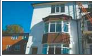
Caterham £800 pcm

Newly decorated & spacious first floor 1 bedroom flat with own entrance in convenient location. The property is located within easy walking distance of Godstone Village. Green and close to M25, A25 and A22. Good sized lounge with fitted kitchen. Avail unfurnished