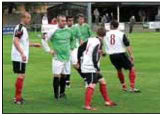
Match action against Horsesham YMCA