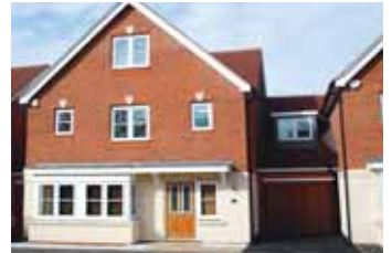
Kenley £500,000 - £550,000

Detached family home with flexible accommodation, four/ five bedrooms. Three/four receptions, kitchen, utility/conservatory, three bathrooms. Parking for several vehicles and a double garage, attractive gardens