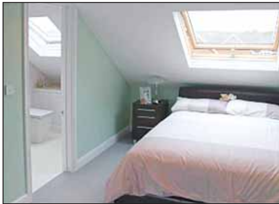
A recent loft conversion by 'Loft' in a modern semi in Caterham-on-the-Hill. Loft created a master bedroom and fabulous en-suite from a timber-filled truss roof in just over eight weeks.

The Loft Complete Conversion Service encompasses full Local Authority regulation matters through to a completed adaptation together with associated certification and warranties. Loft can even undertake decoration and floor finishes as part of the design service. If you are considering using your empty attic and would like to investigate how to generate best use of space then please call 0845 601 1729, email info@loftdesignservice.com or visit their web site - www.loftdesignservice.com