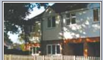
Caterham £1600 pcm

A stunning first floor two bedroom two bathroom furnished apartment located within Netherne Village. Accommodation includes, entrance lobby and hallway benefiting from beautiful hard wood flooring leading to a large living room with feature gas fire place.