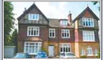
Caterham On The Hill £850 pcm

Well presented and spacious 2 bedroom maisonette in central position in Caterham on the Hill with 1 allocated parking space. Avail unfurnished