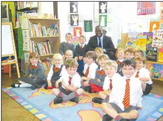
Sam Gyimah MP with some of the pupils from Oakhyrst Grange School during his recent visit to the school.