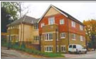
Caterham Valley £995 pcm

2 double bedroom apartment within easy walking distance to town centre and train station. Fully fitted kitchen with all appliances supplied. Family bathroom. Spacious lounge. Allocated parking space within electronic gated car park.