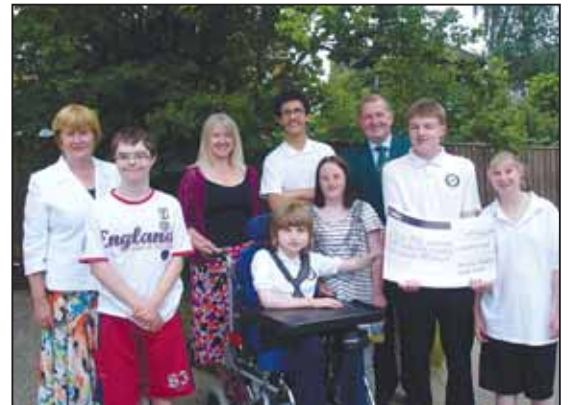
Delighted Clifton Hill students with the cheque donated by patrons and members of North Downs Golf Club.