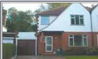
Caterham £1200 pcm

Impressive 2 bed top floor apartment in Grade 2 listed Georgian manor house. 10 minutes from Oxted town centre. Newly decorated. Modern stylish kitchen. 1 double and 1 single bedroom, both with fitted wardrobes. Bathroom. Garage, parking, grounds. Avail unfurnished