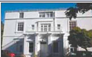
Tandridge £995 pcm

First floor apartment with two double bedrooms. Master bedroom with fitted wardrobes and ensuite shower room. Second double bedroom. Family bathroom. Very good sized lounge with balcony. Stylish fully integrated kitchen. Neutral decor throughout. Avail unfurnished