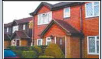
Caterham On The Hill £995 pcm

Character 2 bedroom cottage in quiet rural location. Living room with parquet flooring and fireplace. Newly renovated Kitchen with range cooker and built in units. 2 double bedrooms upstairs and newly renovated bathroom. Avail unfurnished