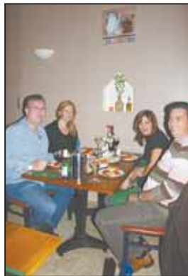
Diners at The Comodor

Other main courses to choose from are Risotto Comodor, Paella and Lasagne.