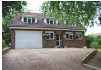
Kenley £575,000 Detached family home with flexible accommodation, four/ five bedrooms. Three/four receptions, kitchen, utility/conservatory, three bathrooms. Parking for several vehicles and a double garage, attractive gardens