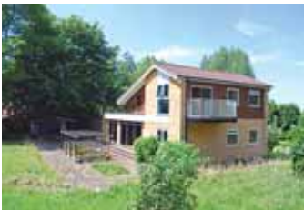
Chaldon £750,000 A four bedroom detached property in a semi rural location within the green belt. Approximately four acres with a separate 2.5 acre field/paddock to the front. Master bedroom with balcony, 29' reception, kitchen, bathroom and shower room.