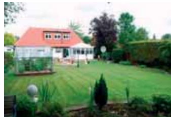
Kenley £599,950 A detached four bedroom chalet style bungalow in a premier private road. Three reception rooms, conservatory, fitted kitchen and three bathrooms. Approximately 150' Attractive and level garden, parking for several cars.