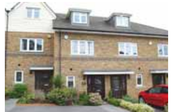
Caterham on the Hill £260,000-£290,000 Three bedrooms, ensuite shower room, family bathroom. Fitted kitchen with integrated appliances, off road parking. Living room with bi-folding doors onto an attractive garden.

0844 335 8334 www.lilypadproperties.co.uk