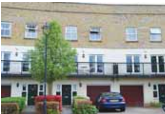
Caterham £385,000 A three double bedroom town house situated in a popular development. Fitted kitchen/dining room, conservatory, living room and two bathrooms. Integrated garage with utility area and off road parking