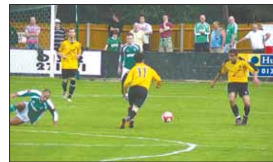
Whyteleafe FC -v- Leatherhead FC, 4th September 2010. The match ended in a 1-1 draw.

October sees home games against Chatham (26th) and Whitstable (30th). See you there.