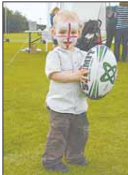
A patriotic tot enters the spirit of the day.

Barracks. The game that followed was played in great spirit and despite the Old Cats winning 41-7 the guards never dropped their heads and said they enjoyed every minute of the game. In the evening a dinner was held in the clubhouse where traditional rugby banter was enjoyed and various items were auctioned. Income from this added to the fundraising during the day and other donations totalled approximately £3,500 to be shared between the Guards Charity, Help for Heroes and the British Legion. Thank you to all who contributed to the day.