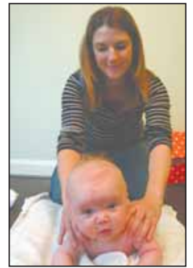
A baby massage session.

"Baby Massage is great for relaxing babies and for strengthening their muscles, as well as encouraging their flexibility and coordination. It can help with colic and teething pain and help regulate their sleep patterns. What I really like about teaching is seeing the bond growing between mother and baby. When babies are really little there aren't many activities that they can actually participate in, so it's lovely for mums to be able to interact with their babies in such a hands-on way.