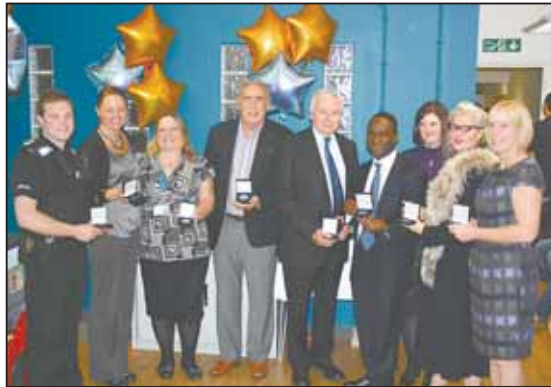
The guests with their awards at Street Youth Centre in Caterham last month.

On Thursday 23rd September, members of Street youth centre in Caterham Valley held a presentation ceremony to thank everyone who had helped them in the setting up and opening of the new facility. MP Sam Gyimah was amongst the guests who filled the youth centre in Godstone Road Caterham Valley to listen to a speech made by members of the management committee. Each of the guests were then presented with a