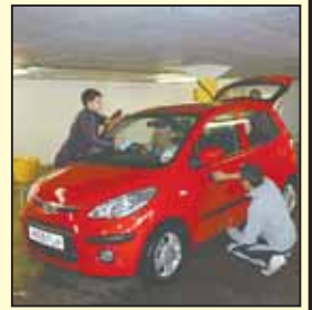
Have your car cleaned 'While U Wait'.

For extra pampering for your car there is an Engine Clean, Special Full Body Polish and Full Valeting