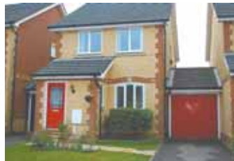
Caterham £279,950 A three bedroom link detached home set in a popular setting close to local amenities. Attractive private garden. Garage and off road parking. No onward chain.