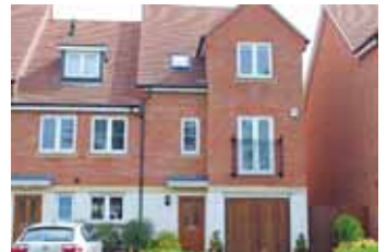
Kenley £399,950 An attractive end terrace town house built by Linden homes within the last four years. Three double bedrooms, two bathrooms, open plan kitchen/dining/family room and living room. Garage and off road parking