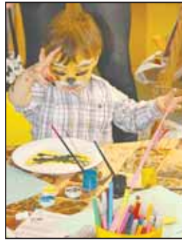
One of the tots gets stuck in with some paints.

Little Treasures is a family run facility and is recognised by its families as offering a homely environment which is welcoming and friendly. At