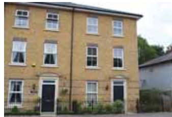
Caterham £365,000 A three bedroom Regency style end of terraced property built in 2007. Three bathrooms, two of which are ensuite, fitted kitchen/breakfast room. Living room, dining room, WC. Garage and parking to the rear