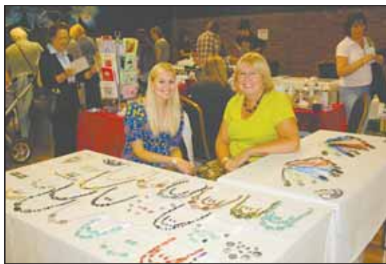
One of the many stalls selling beautiful crafts at The Arc.