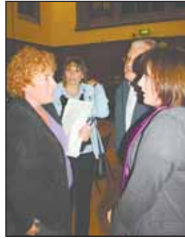
Residents share their views following the meeting.