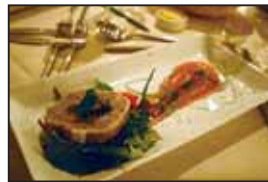
The pheasant terrine starter.

ing forward to their first Christmas when they will be open for Christmas Day lunch. Main course prices at 'Chez Vous' start at £12.50 and a bottle of house wine starts at £15. The full menu can be viewed at www.chezvous.co.uk . To book a table, call 01883 620451.