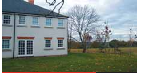
CATERHAM 01883 349114

A two bedroom Ground Floor maisonette situated on the edge of the Netherne development with far reaching open views to the front. The property features a 15' lounge, open plan fitted kitchen, and doors from the bedroom to a patio area. Within the development is a sports centre with pool and gym for use by the residents.