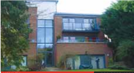
KENLEY 020 8668 1000

Well presented modern three bedroom first floor apartment with two balconies and allocated parking. Master bedroom with en suite bathroom. Fully fitted kitchen with granite worktops.