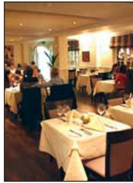
The spacious interior of 'Chez Vous.'