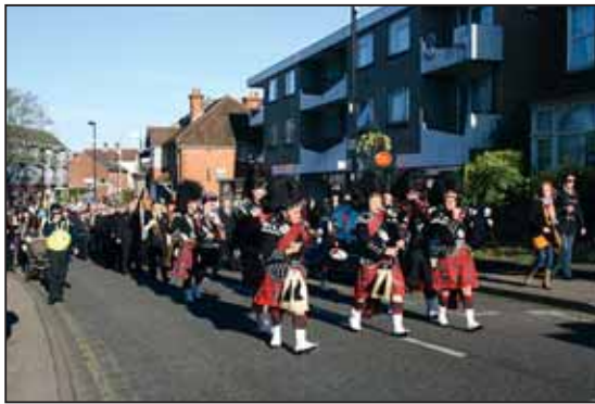
The Surrey Pipe Band at the head of the parade in the High Street, Caterham-on-the-Hill, on Remembrance Sunday.