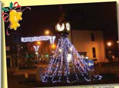
The new Christmas Lights in Caterham Valley town centre.