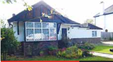
CATERHAM 01883 349114

Situated in a village location, this three/ four bedroom detached property offers spacious family sized accommodation with level gardens, driveway parking and a workshop. The property has been updated by the current owners and features a refitted kitchen/diner, a refitted family bathroom and en-suite and four double bedrooms.