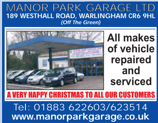
Photos of Warlingham