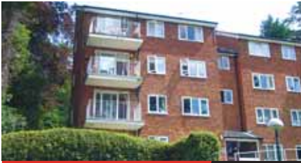
KENLEY 020 8668 1000

Two bedroom ground floor apartment on popular "Barratts" development. Lounge/diner, refitted bathroom, kitchen, gas central heating, patio/balcony with space for table and chair, two parking spaces.