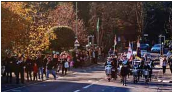
The Whyteleaf parade led by the band of TS Ambuscade.

had special significance this year following the recent renovation of the memorial.