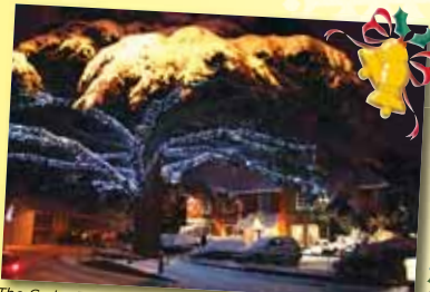
The Cedar Tree lights in Caterham-on-the-Hill.