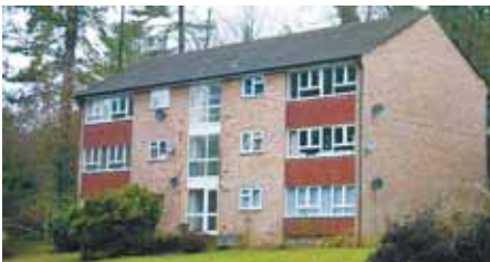
KENLEY 020 8668 1000

Two bedroom second floor purpose built apartment, redecorated, refitted bathroom and kitchen, communal gardens, garage en bloc, outstanding views. Half mile to station.