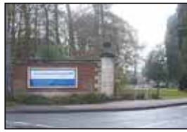
The entrance to the Oaklands site in Caterham-on-the-Hill.

Concerns expressed over proposed new development in Caterham-on-the-Hill.