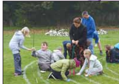
Hillcroft School pupils planting crocus bulbs in Queen's Park.