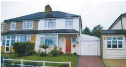
KENLEY 020 8668 1000

A three bedroom semi detached house close to both Whyteleafe and Upper Warringham Stations. Garage, off street parking, landscaped garden and patio.