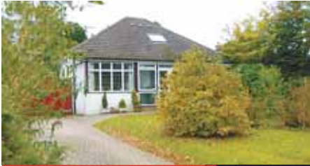
CATERHAM 01883 349114

A four bedroom, detached chalet bungalow with large level gardens situated in a popular location within half a mile of shops and schools. Scope for further improvements/extension subject to consents.