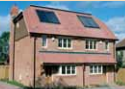
THE MARLBOROUGH 4 bedroom semi-detached house ONE ONLY £385,000

This is the perfect time of the year to make a fresh start & we think that we have the ideal new home for you at Eaton Place, Caterham on the Hill.