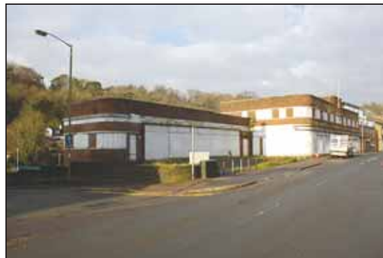
The old Rose & Young building in Croydon Road, Caterham.