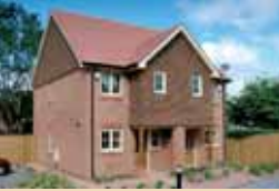
THE WINCHESTER 2 bedroom semi-detached house ONE ONLY £285,000