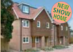
THE HARROW 3 bedroom terrace house PRICES FROM £305,000