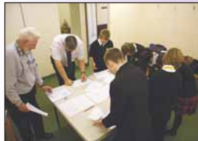
de Stafford pupils helping to design the Crocus Maze.