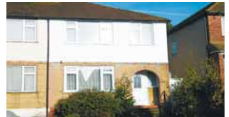
CATERHAM 01883 349114

A three bedroom semi detached house with extended ground floor accommodation and large workshop as well as off road parking and low maintenance gardens. No onward chain.