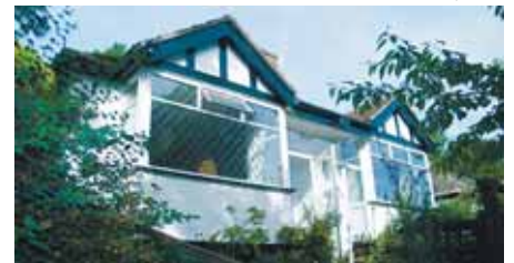
KENLEY 020 8668 1000

Three bedroom detached chalet bungalow. Extensive valley views, garage, school catchments, direct access to Kenley common. Approximately three quarters of a mile from two stations. No chain.