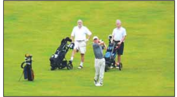
Golfers at last year's charity event at Bletchingley Golf Club.