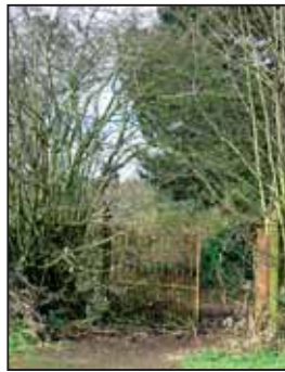
The gate at the entrance to the St. Lawrence's Hospital burial ground before the renovations took place.

The restoration has included the installation of a chain-saw carved seat, bird boxes and a memorial board that tells visitors about the burial ground. Several cub and