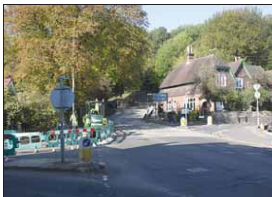
The site of the mini-roundabout under construction in Caterham.