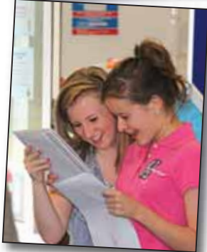
Above - Excited Warlingham School students check out their results.

grades. After receiving such excellent results, students will be ready to join Warlingham School's 'Outstanding' (OFSTED 2008) Sixth Form.