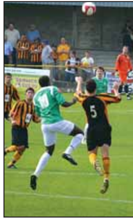
Whyteleafe v Folkestone Invicta.