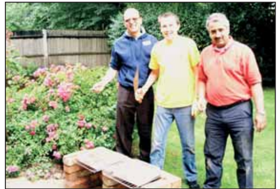
Volunteers with the new barbecue in the garden of Diana Francis House.