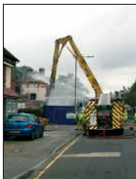
The demolition crane at the site following the fire.

attended the scene along with five fire engines from Surrey Fire and Rescue who brought the blaze under control. The Godstone Road was closed for several hours while the fire was extinguished and the building demolished. Laurence Daniels, whose back garden in Mosslea Road backs on to the railway line behind the Old Boatyard said: "It was terrifying. When we saw the flames leaping up to the flats next door we were horrified. We have been afraid this might happen for years." Anyone with information regarding this arson is urged to contact DC Brunt at Surrey Police on 101, quoting reference number TD/11/4544.