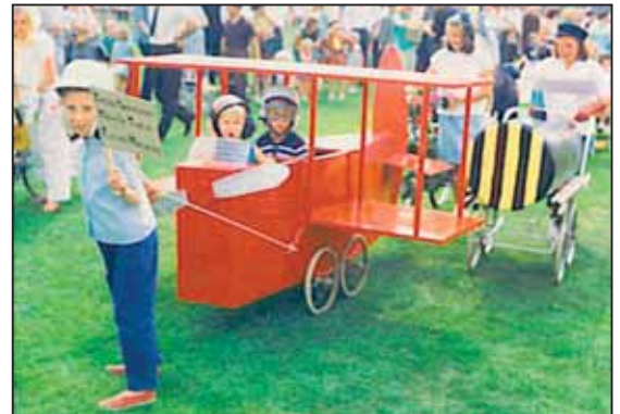
'Those Magnificent Men in their Flying Machines' photographed at the Chaldon Fête in 1967.

On August Bank Holiday Monday the Chaldon Village Fête held in the field of St. Peter and St. Paul's School raised about £6,000 for local charities again this year.