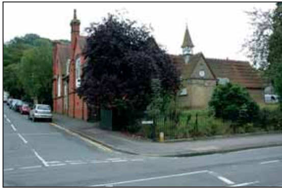
The old Adult Education Centre in Caterham Valley.

in keeping with the area and it must not be allowed to exacerbate the already severe parking problems that exist. "The hard work and commitment that the local residents have put into defending this area against gross overdevelopment is a wonderful example of the 'Big Society' in action, and I applaud them for their efforts." Details of the planning application can be viewed on the Planning portal of the Tandridge District Council website: http://www.tandridge.gov.uk Application No. 2011/688