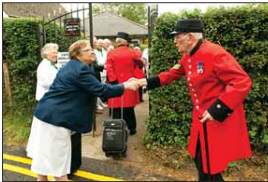
The Chelsea Pensioners arrive at Caterham Bowling Club.