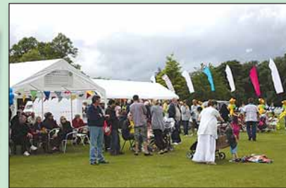
Crowds dodging the showers milled around by the refreshment tents.