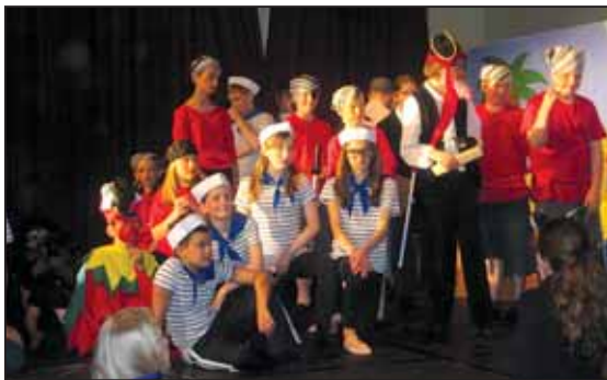
Cast members of 'Pirates of the Curry Bean'.

The play was directed by the Year Six team and the costumes and set were made by other members of staff.