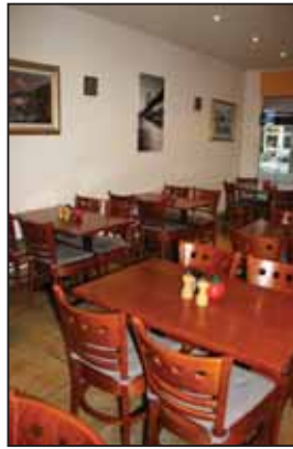
The modern interior of Grillerz.

I chose the Gourmet Beef burger with choice of chips (original, spicy, smokey or cheesy) that costs £4.99. Up came a thick, juicy burger in a bap with chips that you could