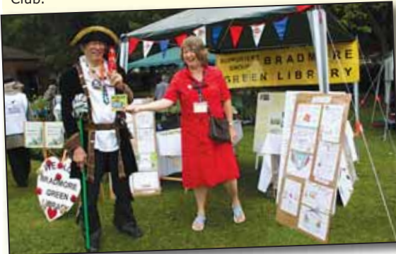
Long John Silver brings fiction to life at the Bradmore Green Library stall.