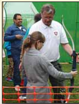
A youngster is given some guidance in the ancient art of archery.