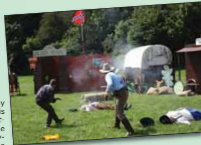
The lively Wild West Show attracted plenty of attention!

The second annual Whyteleafe Village Fête on Sunday 1st June was a great hit with local residents again this year, although the regular downpours made things a little tricky for the stallholders! However, in between the showers there was plenty going on to entertain everyone, and delicious refreshments including homemade cakes, sandwiches and snacks from the Village Bakers stall, freshly cooked paella at the Costa del Sol stall, burgers and a beer tent. The Cats Protection League, St. Catherine's Hospice and C.H.E.C.K. (Community Health and Education for the Children of Kimilili) and other charity stalls were generously supported by the visitors and some lucky winners went home with a prize from the Grand Raffle. There will be more fun and games in Whyteleafe at the Help for Heroes day being organised for Sunday 16th September. Attractions will include a steam railway, vintage cars, a hawk display, a dog show and craft stalls with a parade taking place from St. Luke's Church to the Recreation Ground. A planning meeting for volunteers is being held on Wednesday 1st August at the Whyteleafe Tavern at 7pm. All are welcome.