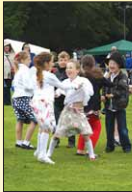
Children from Bradmore Green Primary School dance for the crowd.