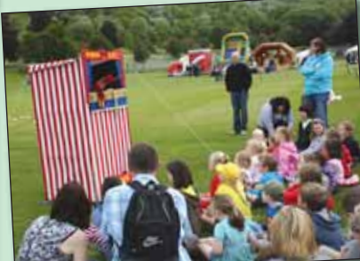
Children and grown-ups enjoy the Punch and Judy show.