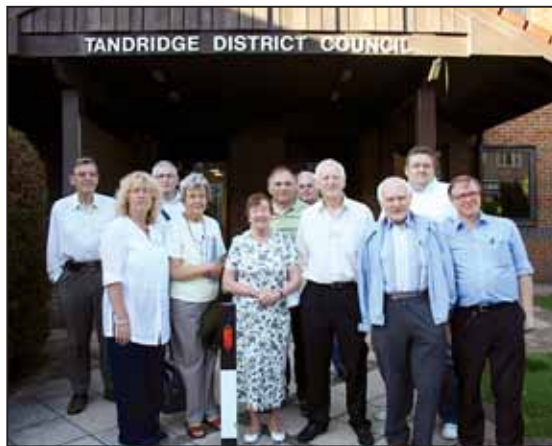
Caterham residents outside the offices of Tandridge District Council before the planning meeting on Thursday 28th June.