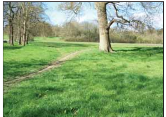
Manor Park, Whyteleafe.

Take the footpath to Plantation Lane which is a gentle climb, and you are rewarded with beautiful panoramic views. Continue along the footpath to High Lane, cross