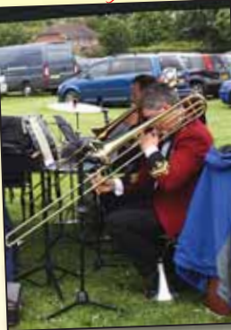
Members of the Crystal Palace Brass Band.