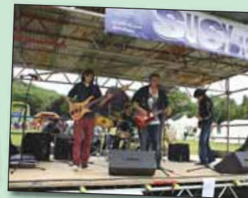
Live bands performed throughout the afternoon.