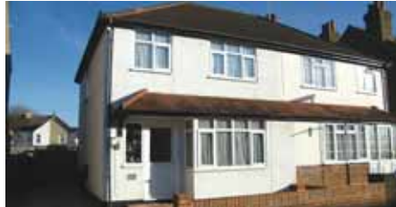
CATERHAM 01883 349114

A well presented semi detached house situated on a level plot with rear gardens of approx 80', mainly laid to lawn and patio. Internally there is a fitted kitchen/diner, separate lounge and three bedrooms as well as a first floor bathroom. To the front of the property is off road parking and gated side access leads to the rear.