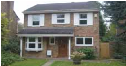
KENLEY 020 8668 1000

A four bedroom detached house with front and rear gardens, double garage and en suite to the master bedroom. The property consists of three receptions including a study and downstairs W/C.