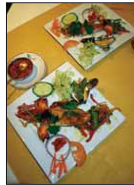
Our amazing starters - King Prawn Grill Suka and Mass Biran.