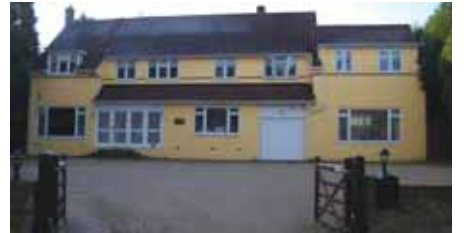
KENLEY 020 8668 1000

Large detached house with self contained two bed annex on a half acre level plot, in prime private cul-de-sac on the former 'Manor Park' estate. Currently arranged with four double bedrooms including master suite, up to five receptions.