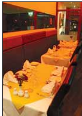
The comfortable interior of The Curry Leaf.

The restaurant provides great service and very pleasant surroundings and would be a great choice for a romantic meal for two this Valentine's Day. For more information or to book a table call 01737 558899.