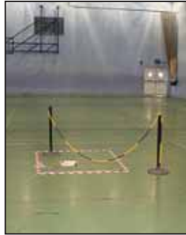
The sports hall at de Stafford showing the unsafe area of the floor.