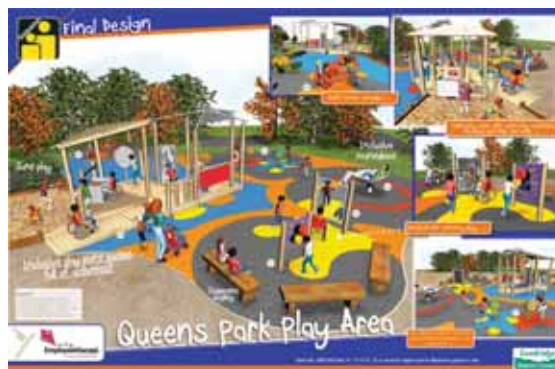
An artist's impression of the new play area.