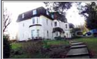
Whyteleafe - £1050 pcm Stunning first floor apartment in convenient location for access to the national rail and road networks. Refurbished to a high standard. Accommodation includes, fully fitted kitchen with integral appliances, modern bathroom with separate shower, 2 bedrooms and large living/dining room. Allocated parking.