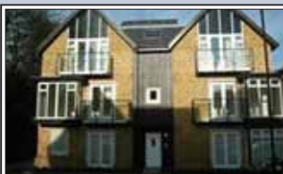
Warlingham - £1195 pcm Brand new 2 bedroom stylish executive apartment. Large lounge with balcony, a separate stylish fully fitted integrated kitchen. Master bedroom with ensuite shower-room. Family bathroom. Allocated parking space.