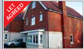
Kenley - £2150 pcm Recently built 4/5 bedroom link-detached property. Large fully fitted kitchen. Dining room/conservatory. Spacious lounge. Master bedroom with fitted wardrobes & ensuite bathroom. Double bedroom with ensuite shower room. 3rd bedroom/office. 2 good sized double bedrooms on top floor sharing a family bathroom. Integrated garage. Garden to rear.