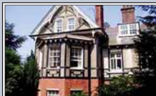
Caterham Valley - £1400 pcm Character 2/3 double bedroom ground floor apartment. Private patio. Large lounge with feature fireplace, dining room. Master bedroom with ensuite shower-room and fitted wardrobes. Fully fitted kitchen, office and second double bedroom with ample wardrobes. Family bathroom. Garage and off street parking.