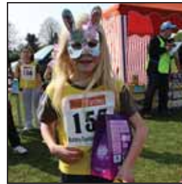
One of the participants at last year's Bunny Fun Run.

The Caterham Rotary Bunny Fun Run is taking place on Sunday April 1st at Queen's Park in Caterham-on-the-Hill so don't forget to register, or pay double on the day! Registration costs £5 for the 5K Race and £2.50 for the 1K Fun Run per person and all runners receive a free Easter Egg. This year the proceeds are going to 'Disability Challengers'. Registration forms are available at www.rotaryruns.co.uk , e-mail: rotaryruns@gmail.com or call 01883 346641.