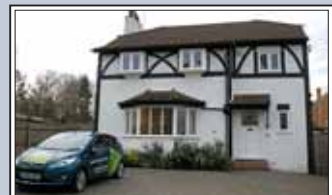
Warlingham - £2200 pcm Attractive and spacious 4 bedroom detached family home in a quiet residential road. Spacious living room. Kitchen has been finished to a high quality with integrated appliances. Upstairs are three double bedrooms and a good sized fourth bedroom. Newly fitted stylish bathroom. WC. Garage to the rear of the property. Level Garden