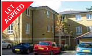
Caterham - £1100 pcm Recently built stylish first floor apartment. Spacious lounge with extra dining area. Separate attractive fully fitted kitchen. Master bedroom with wardrobes and ensuite shower room. Family bathroom. Furnished. Allocated parking.