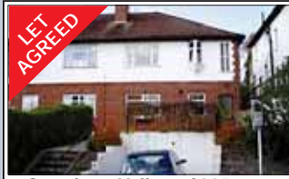
Caterham Valley - £895 pcm Very well presented 2 bedroom ground floor maisonette walking distance from shops & station. Large lounge. Double bedroom with fitted wardrobes. Modern bathroom. Stylish kitchen with parking.