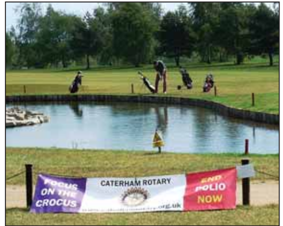
Easy does it! A golfer prepares for a tricky shot at last year's Rotary Golf Day.

Golf enthusiasts have the opportunity to take part in a great annual golfing event whilst raising money for some very good causes this May. The Rotary Club of Caterham Charity Golf Day is being held on Monday 14th May at the beautiful Bletchingley Golf Club. Teams of four can register for the 18 Holes Stableford Fourball for £240 or individuals pay £60. The day will start with coffee and bacon rolls at 8am, teeing off from 9am. The cost includes a two course lunch at the conclusion of your round. Last year's Charity Golf Day raised over £4,000 for St. Catherine's Hospice and local and international Rotary charities. The sum raised was £500 more than the previous year, and Rotary hopes the proceeds will be higher again this time around. The proceeds from this year's event will be divided between the Rotary charities and The Children's Trust in Tadworth. The Children's Trust provides a range of services for children with multiple disabilities, in-