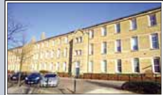
Caterham - £1095 pcm Well presented 2 double bedroom first floor apartment. Large double aspect lounge. Fully fitted kitchen. Master bedroom with fitted wardrobes and ensuite shower-room. Family bathroom. One allocated parking space and ample visitor bays.