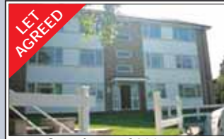
Caterham - £900 pcm Immaculate condition 2 bedroom top floor flat. Fully fitted kitchen. Spacious lounge. Stylish bathroom.