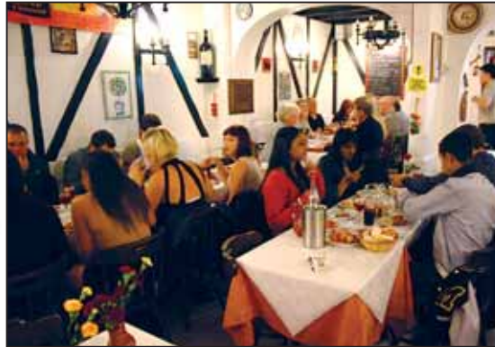
A busy Saturday night at Costa del Sol.

For our main course, I chose the Paella Valencia - classic spanish rice, chicken and shellfish and Lyn had the Lubina sin Hueso - Fillet of Sea Bass with Prawns and Cream Sauce. Both meals had been cooked to perfection and were lovely and filling,