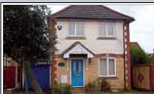
Caterham On The Hill - £1300 pcm Well presented 3 bedroom detached house. Two reception rooms, fully fitted kitchen. Lounge leading to level garden. Master bedroom with fitted wardrobes and ensuite shower-room. Second double bedroom with fitted wardrobes and third single bedroom. Family bathroom. Garage and ample off street parking.