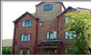
Caterham Valley - £795 pcm 2 bedroom flat within minutes of Caterham. Good sized main bedroom with fitted wardrobes. Second single bedroom. Parking.