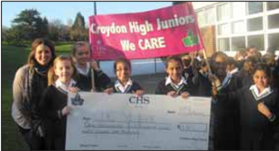
The girls from Croydon High with their cheque for Clic Sergeant.