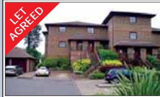
Caterham - £1195 pcm 2 double bedroom first floor apartment. Fully fitted kitchen. Huge double aspect lounge with room for separate dining area. Master bedroom with ensuite bathroom. Outside is a garage and one allocated parking bay.