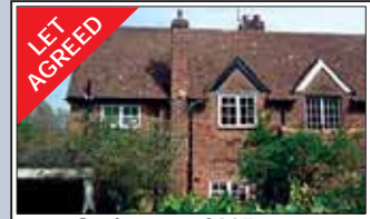
Godstone - £995 pcm Character 2 bedroom Victorian cottage. Living room with parquet flooring and fireplace. Recently renovated kitchen with range cooker and built in units. Bathroom. Front and back garden. Garage.