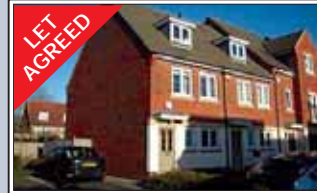
Kenley Park - £1350 pcm Recently built 3 bedroom end of terrace townhouse. Open plan and spacious lounge/dining room with fully integrated stylish kitchen. Master bedroom with fitted wardrobes & ensuite shower room. Family bathroom. Allocated parking.