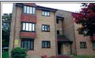
Whyteleafe - £650pcm Stylish ground floor one bedroom flat in convenient location for 2 train stations. Fully fitted kitchen with spacious lounge. Bathroom. 1 allocated parking space.

WE NEED YOUR PROPERTY OUR STOCK IS BEING LET AT RECORD SPEED QUALITY TENANTS NEED TO MOVE TODAY!!