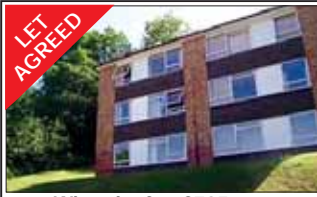
Whyteleafe - £795pcm Recently renovated 2 double bedroom ground floor flat. Good sized lounge. Newly fitted bathroom. Fitted kitchen with appliances. Single garage and ample parking