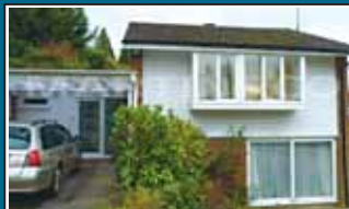
Caterham Valley - £1700 pcm

Well presented 3 bed end of terraced house. Recently fitted kitchen. Level rear garden. 2 allocated parking. Avail February.