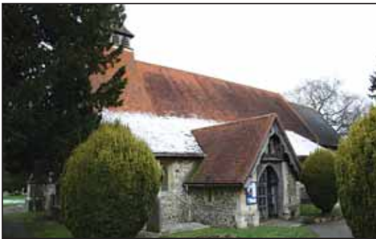
All Saints' Church in Warlingham.