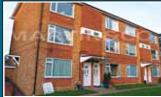
Caterham - £950 pcm

Spacious ground floor maisonette located by Kenley station. Large living room with wooden flooring. Stylish fitted kitchen. Avail