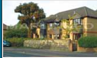
Whyteleafe - £795 pcm

One bed top floor flat in town centre location within minutes walk of Caterham station. Stylish kitchen. Open plan living room and bedroom with good sized wardrobes. Bathroom. Avail u/f.