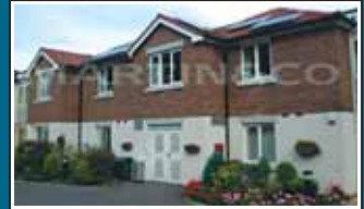
Caterham - £850 pcm

1 bed first floor maisonette mins from 2 stations. Spacious lounge. Allocated parking. Avail u/f.