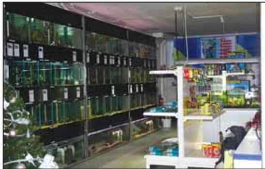
'H2O Habitat'.