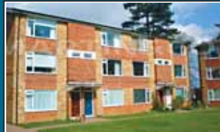
Caterham - £895 pcm

Well presented and stylish 2 double bedroom first floor flat. There is a large lounge with patio doors leading onto a balcony. Stylish fully fitted kitchen. Bathroom. One allocated parking space. Avail u/f.