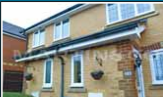
Caterham On The Hill - £1395 pcm

Stunning 2 bedroom ground floor apartment in prestigious gated development. Good sized lounge. Family bathroom. Fitted kitchen. Allocated parking. Avail part furnished.