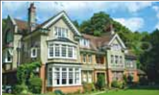
Caterham Valley - £1100 pcm

Spacious executive 2 double bedroom first floor apartment. Large lounge with separate fully fitted kitchen with integrated appliances. One allocated parking. Avail u/f.