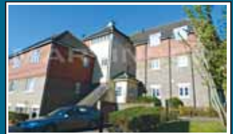
Caterham - £1050 pcm

Newly decorated 2 double bedroom split level maisonette. Double aspect lounge/dining room. Garage. Avail