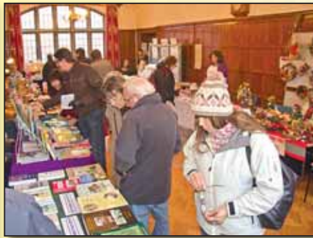
Visitors browse the Christmas stalls inside the Soper Hall.