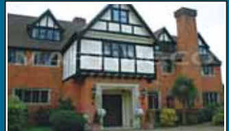
Oxted - £1300 pcm

Two bedroom bungalow has been completely refurbished. Good sized lounge. Brand new kitchen with integrated appliances. Brand new bathroom. Garage. Avail u/f.