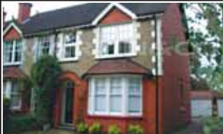
Warlingham - £895 pcm

Newly built first floor 2 bedroom retirement property. Good sized lounge with Juliet balcony and kitchen. Avail u/f.