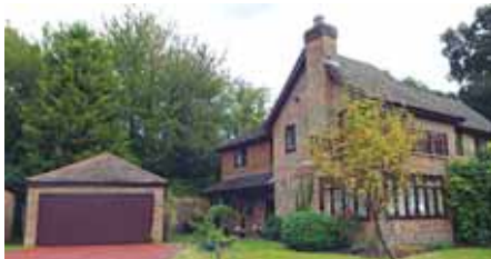
KENLEY 020 8668 1000

Five bedroom, four reception, three bathroom house with a level plot located at the end of a sought after cul de sac in the heart of Kenley. Features own private wood, double garage and in proximity to Kenley Common and The Hayes School.