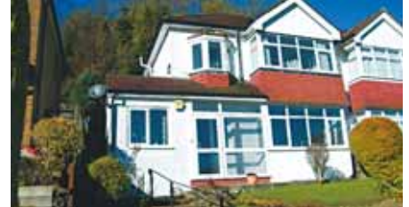
CATERHAM 01883 349114

A spacious, extended and improved semi detached house situated in an elevated position with views over Caterham Valley. The property features an open plan lounge/diner, an extended kitchen and a study/bedroom 4. To the first floor are three bedrooms and a bathroom.