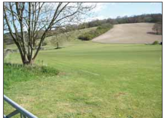
Marden Park, Woldingham. Photograph by Ruth Sear.

described here. You can extend your walk to Marden Park from Manor Park in Whyteleafe, near Burntwood Lane. Enter the pedestrian walkway of Wapses Lodge roundabout and take the exit for Woldingham Road. Before the viaduct, walk to the driveway that leads to Woldingham School, but take the left turning to Marden Park Farm. This will add a further two miles to your walk in the Park. Refreshments are available in Knight's Garden Centre in Woldingham Road.