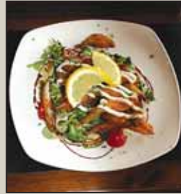
My starter - Whitebait with garlic and lemon mayonnaise.

We could not manage dessert but they had a mouthwatering selection of traditional favourites on the menu including Pecan Pie, Apple Crumble, Rich Chocolate Cheesecake and Eton Mess. Throughout our visit the service was excellent and the atmosphere was warm and welcoming.