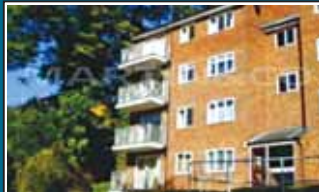
Whyteleafe - £895 pcm

Two bedroom ground floor maisonette. Spacious Lounge. Fully fitted kitchen and stylish modern bathroom. Access to private rear garden. Avail u/f.