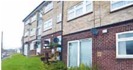
KENLEY 020 8668 1000

This one bedroom ground floor flat is situated in a tucked away location close to Whyteleafe centre. The property features an open plan kitchen, lounge with patio doors leading to the communal garden and a double bedroom. A particular feature of the property is the recently refurbished shower room.