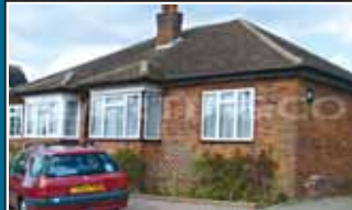
Warlingham - £1250 pcm

Beautifully presented spacious 2 double bedroom apartment. Spacious lounge. Stylish fully fitted kitchen. Secure gated underground allocated parking. Avail u/f.