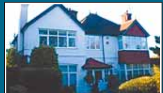
Purley - £2500 pcm

An attractively presented 5 bedroom detached property. Large lounge. Separate dining room. Good sized fully fitted kitchen/breakfast room. Avail u/f.