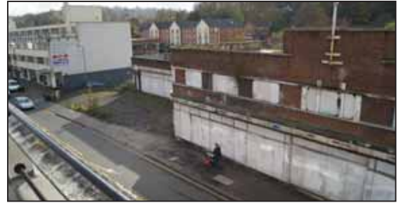
The Rose & Young building in Croydon Road, Caterham.