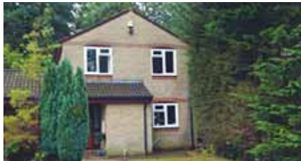
KENLEY 020 8668 1000

A very well presented, deceptively spacious four bedroom, two bathroom detached house located within a quiet cul de sac backing onto Kenley Common. The property features an extended lounge/diner, large kitchen/breakfast room, downstairs shower room, driveway with off street parking.