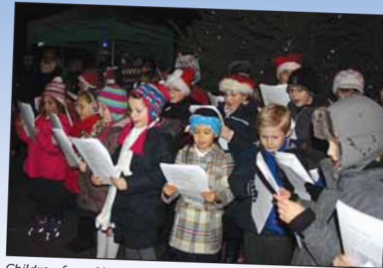
Children from Merstham Primary School singing carols to entertain the shoppers.