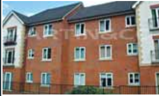
Caterham Valley - £695 pcm

Spacious and newly decorated top floor one bedroom retirement flat. Lounge with feature fireplace. Fitted kitchen. Outside there is secure parking facilities. Avail u/f February.