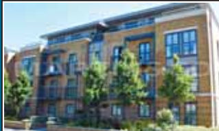
Caterham Valley - £1100 pcm

Spacious top floor charming 2/3 bedroom apartment. Large lounge. Fully fitted kitchen. Bathroom with corner bath. Allocated parking. Avail part furnished February.