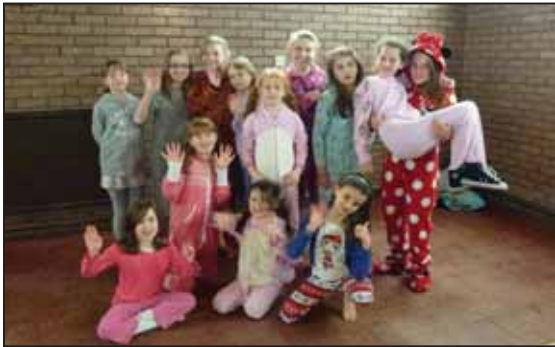
The pyjama-class 'Star Steppers'.