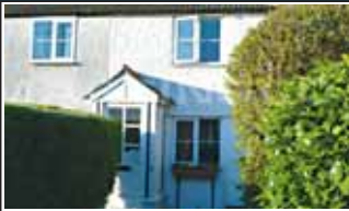
Godstone - £900 pcm

Two bed first floor flat close to town centre. Stylish kitchen. Parking. Avail u/f.