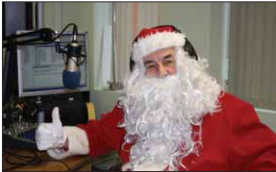
Father Christmas at Ridge Radio.

early because I cannot deliver your presents whilst you are awake." Father Christmas gave Christmas wishes to some local children who had written in to the show. He also asked if children could leave out some carrots for his hard working reindeer. In the week of Monday 10th December, Caterham Rotary Club and Father Christmas went around the local streets with their Christmas float to raise money for local charities and allow Father Christmas to meet some of the children who had sent him Christmas lists and check whether they should be on the good or naughty list!