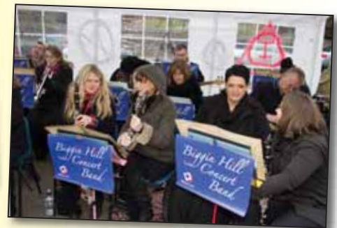
The Biggin Hill Concert Band.