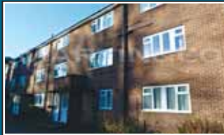
Kenley - £950 pcm

One bedroom cottage located close to Godstone Village. Lounge. Fitted kitchen. Bathroom. Avail.