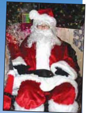
Santa in his grotto in 'Potters Music Shop'.