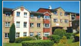
Caterham Valley - £895 pcm

Well presented 2 double bedroom ground floor maisonette. Own front door opening onto hallway with good sized storage cupboards. Good sized bathroom. Spacious lounge/dining room. Fitted kitchen. Garage & parking. Avail u/f January.