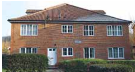
KENLEY 020 8668 1000

A well presented first floor, two bedroom flat situated in a quiet position within this popular modern development close to both Whyteleafe and Upper Warringham Stations. The property features a 13' Lounge. Fitted kitchen and parking.