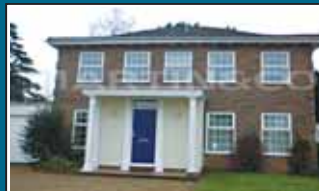
Caterham Valley - £2250 pcm

Spacious 3/4 bedroom detached house. Spacious lounge and dining room. Fitted kitchen. Master bedroom. Family bathroom. Garden. Garage. Avail u/f.