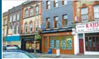
Caterham - £700 pcm

Spacious and newly decorated top floor one bedroom retirement flat. Lounge with feature fireplace. Fitted kitchen. Outside there is secure parking facilities. Avail u/f February.