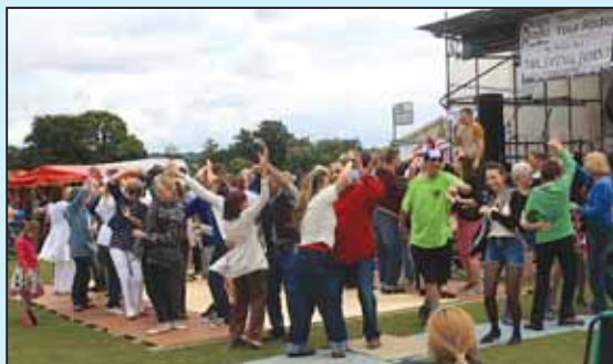
A swing jive lesson at DeFest.

Entry to this day is £3 for children and £5 per adult. Tickets can be purchased in advance and full details can be found at www.defest.co.uk