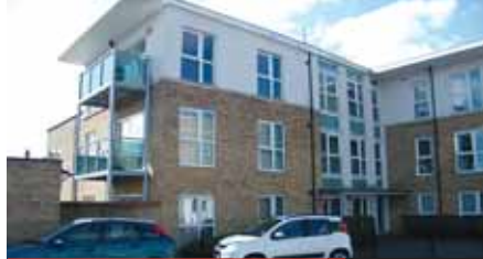
CATERHAM 01883 349114

A rare opportunity to purchase a 50% share of this light and spacious one bedroom flat situated on The Village at Caterham on the Hill. This top floor property features a fitted kitchen and bathroom a spacious double bedroom with built in wardrobes and a large walk in storage cupboard that could be used as a study area.