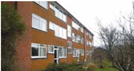
CATERHAM 01883 349114

Situated with quarter of a mile of Caterham station and town centre, this two bedroom first floor flat would make an ideal first time buy or investment property and is share of freehold. As well as featuring two double bedrooms and a refitted kitchen and bathroom there is a 16' lounge with open views over Harestone Valley.