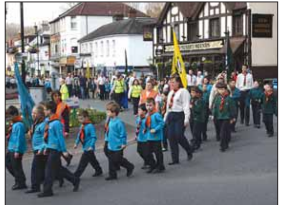
The parade marches through The Square in Caterham Valley.

running almost ten years and where numbers are rising. In honour of George's Day on Tuesday 23rd April local Cubs, Scouts and Beavers wore their uniform to school.