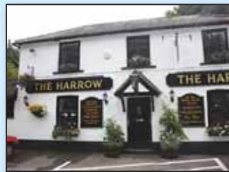
The Harrow in Stanstead Road, Chaldon, one of the pubs on the Festival Ale Trail.

The Caterham Festival organisation do not condone drinking and driving.