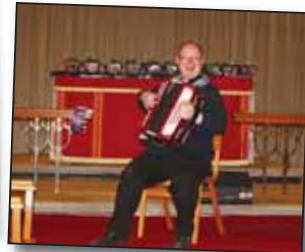
And even live entertainment!