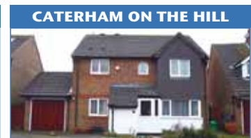
A four/five bedroom detached family home with driveway, garage and larger than average level rear garden situated on the popular Yorke Gate development. EPC: D UPC1106