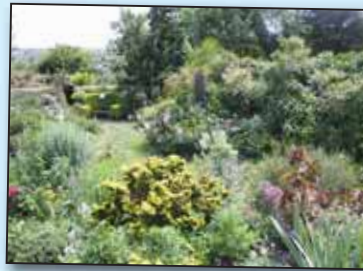
The award-winning garden at 116 Burntwood Lane, Caterham.

3pm-4.30pm and every Sunday throughout the summer. Come and see the famous mural in this 900 year old church.