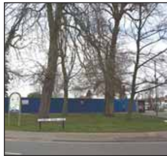
The site of the proposed Lidl store.