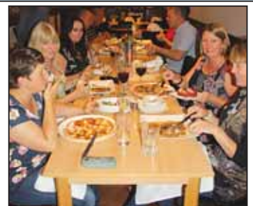
Diners at La Fiaba del Mediterraneo.

Dewan-E-Am, 188 Coulsdon Road, Caterham-on-the-Hill. 01883 348913. The Village Inn, 83A Coulsdon Road, Caterham-on-the-Hill. 01883 341871. Little Paradise, 66 Croydon Road, Caterham Valley. 01883 337636. I Sapori Di Sorrento, 63 Croydon Road, Caterham Valley. 07851 684859. Costa Del Sol, 215 Godstone Road, Whyteleaf. 01883 386789. See www.caterhamfestival.org for details.