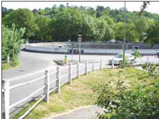
Wapses Lodge roundabout, Caterham.

Woldingham Road) that led to Marden Park. In the 1841 Census the occupier of 'Waps's Lodge' was an ostler who was employed locally. The most probable explanation of the word 'wapses' is a derivation of the old English word 'wop' meaning tearful or weeping. Water once welled from the ground near Wapses Lodge and joined the nearby Bourne, and the area was subject to flooding over the centuries.