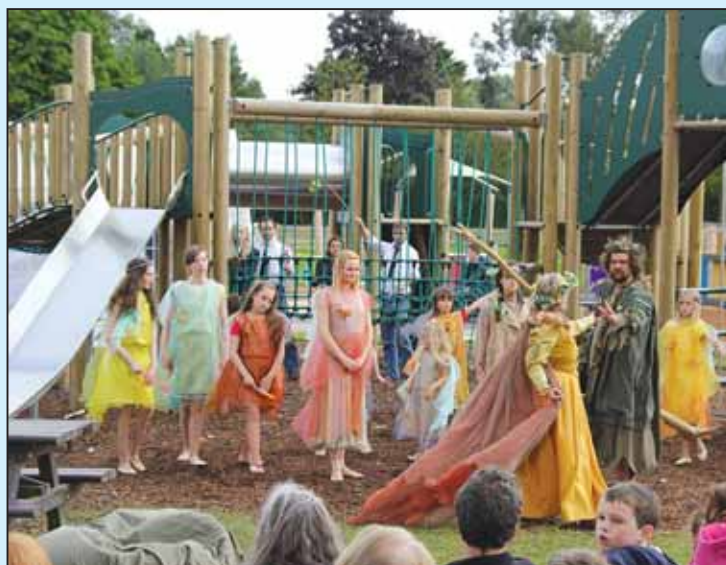
Oberon, Titania and the Fairies played by the Another Way Theatre Company created a magical scene in Queens Park at last year's Caterham Festival.

Shakespeare in Queens Park, Caterham. After the popularity of A Midsummer Night's Dream last year, Another Way Theatre is thrilled to have the opportunity to produce Shakespeare's Antony & Cleopatra. Their vivid telling of the story offers a fresh look at the epic nature of the doomed love affair that rocked the ancient world. Tickets from £8.00 from www.anotherwaytheatre.co.uk