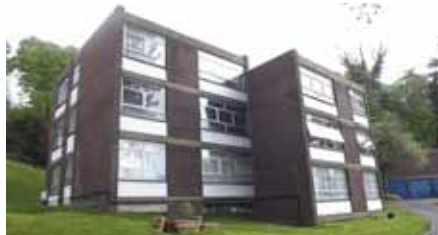
KENLEY 020 8668 1000

Extremely large two double bedroom flat with garage, large lounge and separate kitchen, gas central heating, double glazing, storage shed. Proximity to Whyteleafe South station. No onward chain.