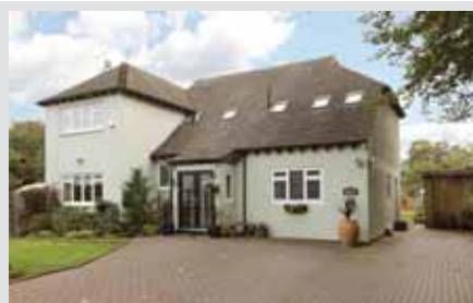
Caterham £650,000 In an idyllic location is this beautifully presented detached house with flexible living space totalling 2357 sq ft. EPC:E