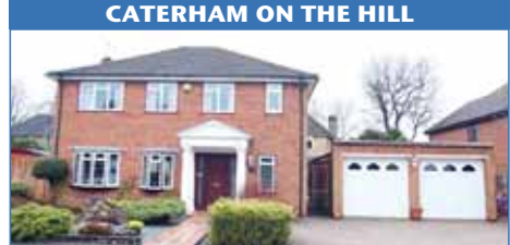
A four bedroom detached family home occupying a prime position with detached double garage to side offering further potential for extension subject to planning permission situated in a highly sought after cul de sac location. Viewing highly recommended. EPC: D UPC1114