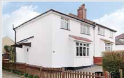
Caterham O.I.E.O. £250,000 A 3 bedroom semi-detached property on a no through residential road with level garden and off street parking. EPC:D