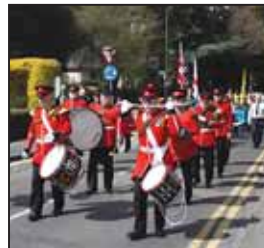
The Warmingham B.P. Scout Guild Band marching in Harestone Valley Road.