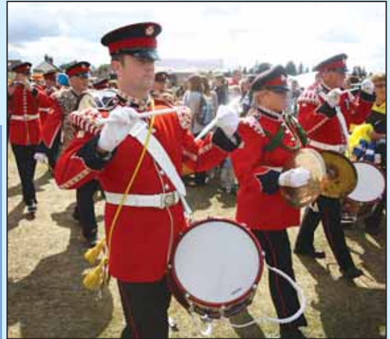
The Warlingham Flute Band at the Caterham Carnival.

9am-5pm International Food Market. Croydon Road, Caterham will be closed to traffic for this very popular Food Market. Stalls from all over the world including many local producers. Why not enter the Caterham Festival Bake Off. See www.caterhamfestival.org for further details. FREE.