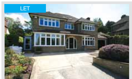
LET Caterham £3,000 pcm A beautiful 5 bedroom detached residence located in a highly regarded road situated near to Caterham School. EPC:C