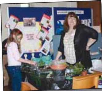
Messing about with plants.