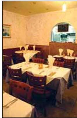
The restaurant interior.