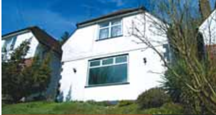
CATERHAM 01883 349114

Situated on an elevated plot with an open outlook across the valley, this two bedroom detached house features large gardens to the front and rear, a 18' lounge with fireplace and an L shaped kitchen diner. Large garden. Scope to update and improve.