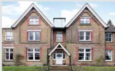
Caterham Guide price £250,000 A beautifully presented 3 bedroom top floor apartment with spacious accommodation, garage and near to Caterham School. EPC:E