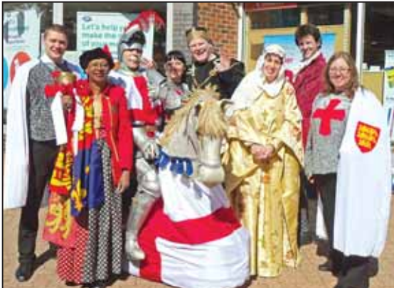
Staff from Church Walk Shopping Centre with St. George and members of the Far Isle Medieval Society.