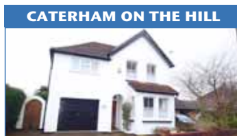
An attractive five bedroom detached period residence with well established level rear garden with driveway and garage currently used as family room/gym situated in a highly sought after residential road. Viewing highly recommended. EPC: E UPC1100