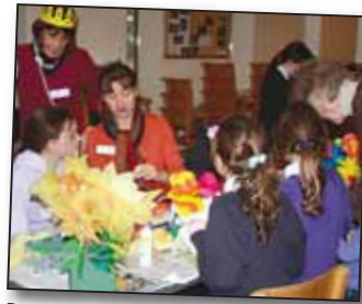
Paper flower making.

On Monday 25th March St. Luke's Church in Whyteleafe held its inaugural 'Messy Church' event with an Easter theme. Approximately 44 people aged from five months upwards attended the lively event with everyone working together to make a wonderful display of flowers, Easter gardens, palm leaves, crowns and Easter cards. They also made two spectacular handprint displays - one of a cross which was put on display in St. Luke's Church and the other of a tree which was put on display at St. Peter and St. Paul's Church in Chaldon.