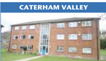
A two double bedroom purpose built ground floor flat set in well established grounds with residents parking conveniently situated for Caterham Valley town centre. EPC: D UPC1115