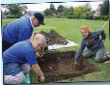
The archeological dig at Queens Park