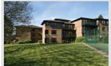
Caterham O.I.E.O. £400,000 A 3 bedroom penthouse apartment with tandem garage, two private balconies and use of residents tennis court. EPC:D