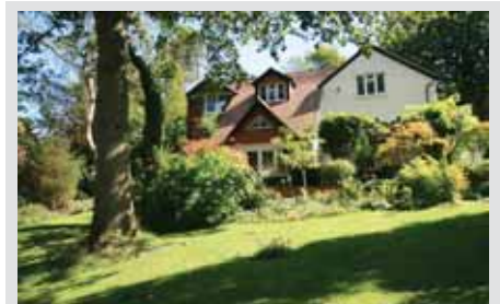
Caterham £700,000 A detached 5 bedroom period property with 5 reception rooms and landscaped garden. No onward chain. EPC:E