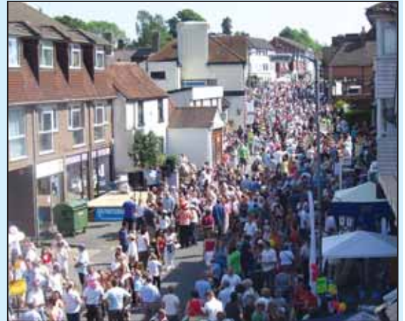
An aerial view of the first Street Party in June 2009.

7pm It's Movie Night showing Casablanca at The Arc, Caterham starring Humphrey Bogart and Ingrid Bergman. Consistently listed as one of the greatest films of all time. Tickets £5/Members £1. Call 01883 330380 or visit www.the-arc-caterham.co.uk