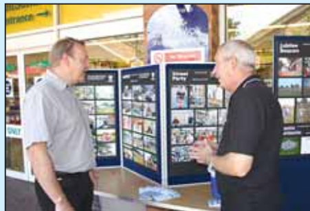
A shopper in Church Walk stops to look at last year's display of Festival photographs taken by Jon Harrison (right).