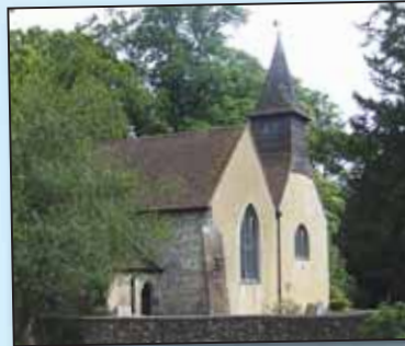
St Lawrence's Ancient Church.