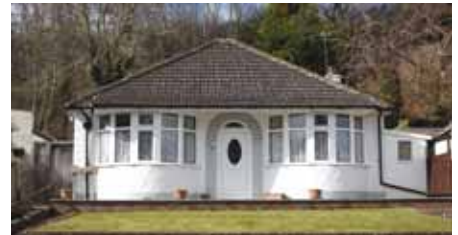
KENLEY 020 8668 1000

Three double bedroom detached bungalow. Large kitchen, lounge, breakfast/sun room, double glazing and gas central heating. Rear garden with direct access and backing onto Kenley Common.