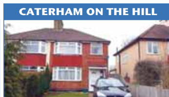
A well presented three bedroom semi detached house with level rear garden situated in a popular cul-de-sac. No onward chain. EPC: TBC UPC1108