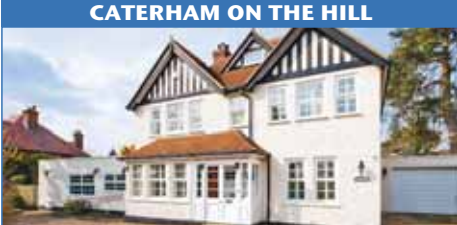
An opportunity to acquire an elegant Edwardian detached family house offering spacious and versatile accommodation with the benefit of a self contained annexe situated in a highly sought after residential road and occupying a well established level plot approaching half an acre. EPC: D UPC1112