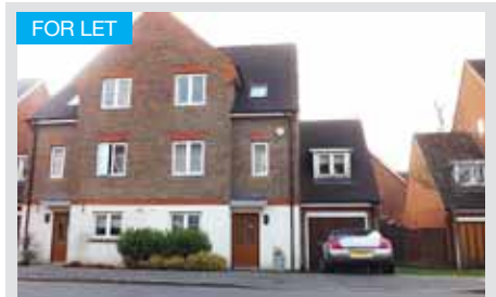
FOR LET Kenley £1,985 pcm An extremely well presented 3/4 bedroom townhouse on the much sought after Kenley Aerodrome development. EPC:C