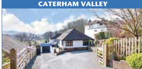
An attractive detached chalet style bungalow offered to the market in the agents opinion in excellent decorative order throughout with a particular feature being the stunning landscaped rear garden offering panoramic views to rear over Caterham Valley and towards greenbelt countryside. Viewing highly recommended. EPC: E UPC1043