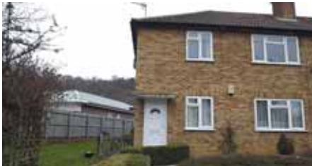
KENLEY 020 8668 1000

Two bedroom first floor maisonette, own garden, garage and parking. Large lounge, separate kitchen, double glazing and gas central heating. Close proximity to two stations.