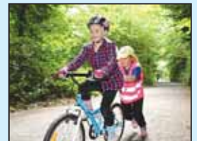
A cyclist at Waller Pain 2012.

10am Waller Pain Cycle Ride. A Caterham Round Table event. How fast can you do the Waller Pain? This event is for fat dads, fit mums, happy children or club cyclists. Cycle UP the 500m of Waller Lane - gradient only 12%! Medals for all. £5.00 per adult, £2.50 per child. See www.caterhamtable.com/