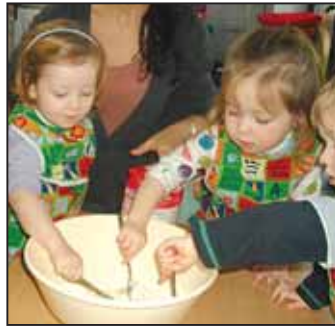
Tots having fun at Hamsey Green Children's Centre.