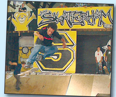
Action at Skaterham.