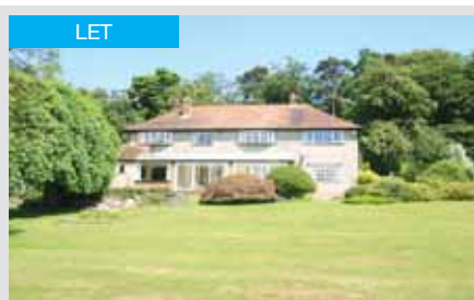
LET Warlingham £2,500 pcm A stunningly located five bedroom character house, situated on private land with far-reaching views of Woldingham valley. EPC:E