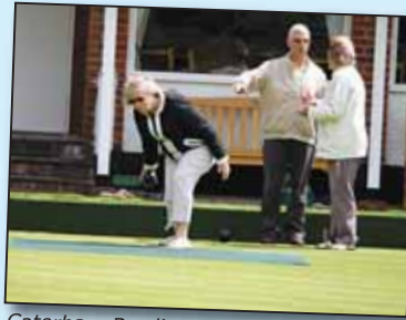
Caterham Bowling Club.