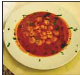
'Prawns Alla Diavola'.