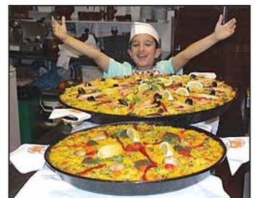
Delicious paellas at Costa del Sol.