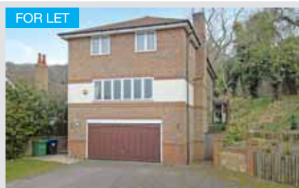
FOR LET Caterham £2,500 pcm A spacious 5 bedroom family home, offering versatile space and situated on a popular close. EPC:D