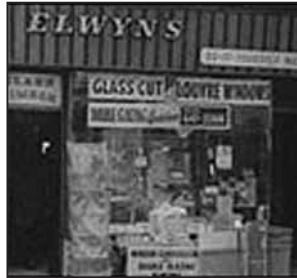
The Elwyns store in Carshalton when it first opened in 1963.

and snacks, have a look at a fantastic new range of front doors and windows and pick up some great deals.