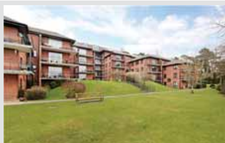
Warlingham £450,000 A spacious split level 3 bedroom apartment within a prestigious development with stunning far reaching views. EPC:D