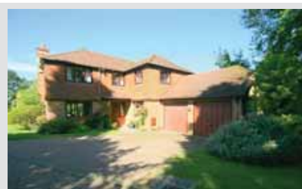
Oakwood Rise, Caterham £2,500pcm 4 bedroom home with great proximity to local amenities. EPC: D Hamptons Caterham & Oxted 01883 759489