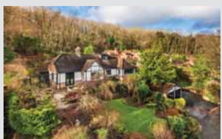
Caterham Guide Price £695,000 Idyllic rural location recently extended. EPC: D Hamptons Caterham & Oxted 01883 759487