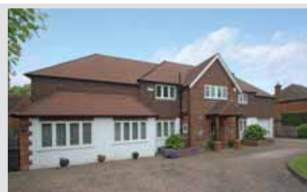
Grimwade Avenue, Whitgift Estate £3,750pcm 5 bedroom family home situated in the Whitgift estate. EPC: D Hamptons Caterham & Oxted 01883 759489