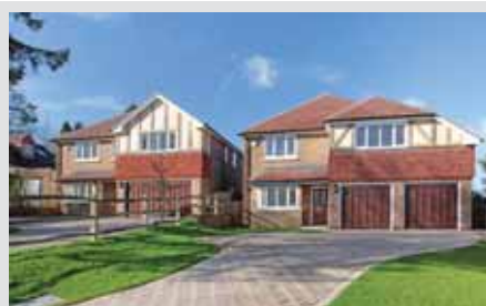
Caterham £795,000 to £845,000 Ready for immediate occupation. EPC: B Hamptons Caterham & Oxted 01883 759487