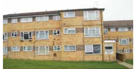
CATERHAM 01883 349114

A 1 bedroom ground floor property situated close to local shops and transport links, and only half a mile from the town and station.