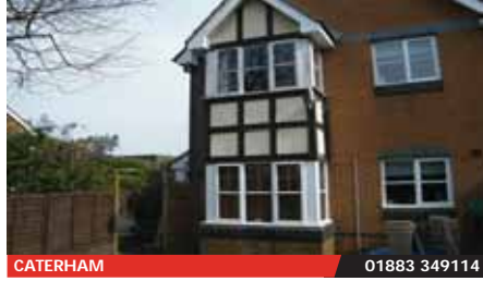
CATERHAM 01883 349114

A 1 bedroom starter house situated on York Gate with private garden and parking for several vehicles. Close to shops and transport links, the property would make a great first time buy.