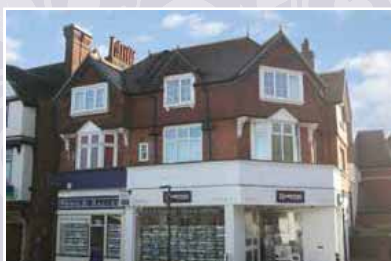
Caterham Valley £139,950

Rarely available one bedroom ground floor conversion flat with allocated off street parking space and lawned communal garden conveniently situated for Caterham Valley town centre. Viewing highly recommended. UPC 1313 EPC Rating D