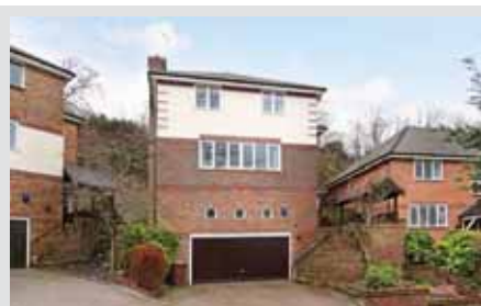
Caterham Guide Price £599,950 A bright and spacious 5 bedroom Family home with views. EPC: D Hamptons Caterham & Oxted 01883 759487