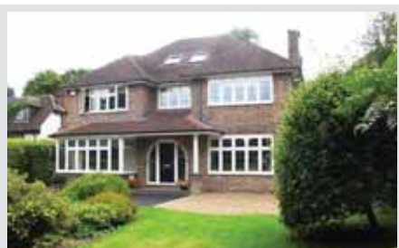
Harestone Hill, Caterham £3,000pcm 5 bedroom detached residence near to Caterham school. EPC: C Hamptons Caterham & Oxted 01883 759489