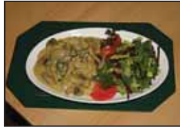
Funghi all aglio.

in coffee and amaretto liqueur and filled with mascarpone cream. I had a 'special', Limoncello Sorbet, which was very refreshing and palette-cleansing. The restaurant offers excellent lunchtime pizza and pasta deals. For more information call the restaurant on 01883 337719 or visit www.lafiaba.co.uk