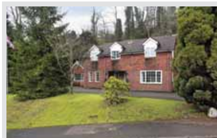
Warlingham £625,000 Family house with extensive living space and views. EPC: E Hamptons Caterham & Oxted 01883 759487