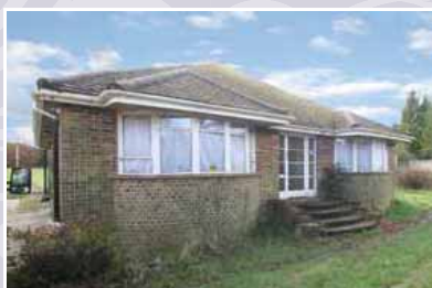
Chaldon Price Guide £650,000

A stunning four bedroom three story end of terrace town house, with landscaped front and rear gardens and allocated off-street parking to rear for two vehicles. Situated in a popular residential road. UPC 1315 EPC Rating TBC