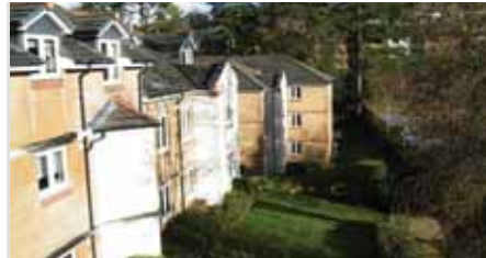
CATERHAM 01883 349114

This entrance level, 2 bedroom retirement flat enjoys an open outlook over the communal gardens. With residents facilities including a garden lounge and house manager, the property is ideal for those wanting peace of mind.