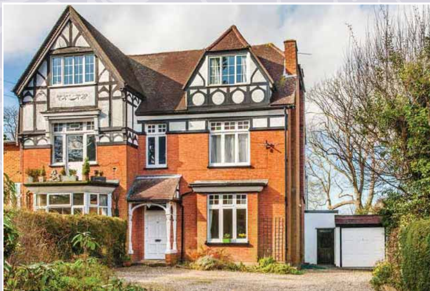
Caterham On The Hill

An opportunity to acquire a recently redecorated studio/one bedroom flat conveniently situated for Caterham Valley town centre and with the benefit of off street parking and no onward chain. UPC 1266 EPC Rating F