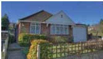
OLD COULSDON £ P.O.A

Successfully Selling Properties Across East Surrey Since 1936