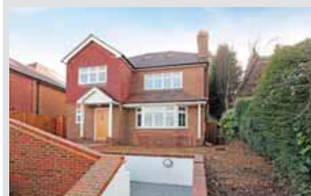
Caterham Guide Price £795,000 Stunning brand new family house near Caterham School. EPC: B Hamptons Caterham & Oxted 01883 759487