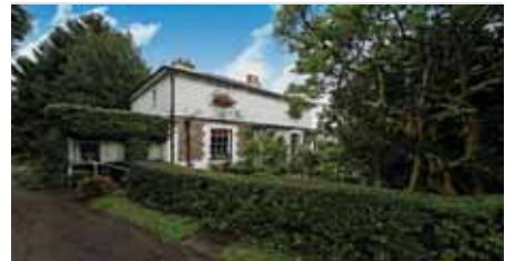
CATERHAM 01883 349114

A grade 2 listed detached cottage set close to the open spaces of Kenley Common. The property retains much of its original charm and character as benefits from approx 2 acres. Featuring 4 bedrooms and a farmhouse style kitchen.