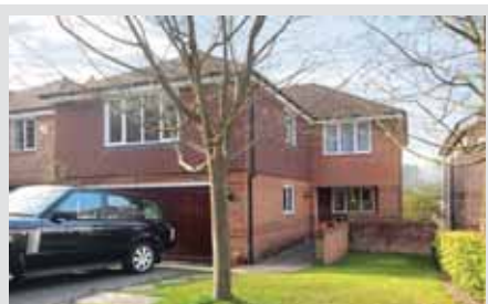
Deerswood Close, Caterham £2,250pcm 4 bedroom home less than a mile from Caterham town centre. EPC: D Hamptons Caterham & Oxted 01883 759489