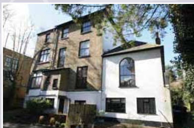
Caterham Valley £175,000

An attractive four bedroom detached residence occupying a well established position with sweeping driveway and detached garage accessed via a private slip road in the highly sought after Harestone Valley area of Caterham. UPC 1302 EPC Rating D