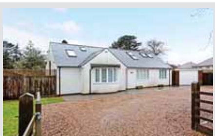
Warlingham OIEO £550,000 Extended bungalow with modern interior. EPC: C Hamptons Caterham & Oxted 01883 759487