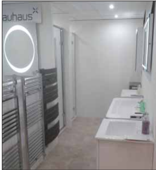
The refurbished bathroom showroom at Premier Heating.

We have also started the year with a Stock Clearance Sale and have a number of ex-display items, or cancelled orders at bargain prices, including a few small kitchen displays that could be ideal for a utility room or small studio flat.