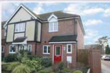
Caterham Hill £285,000

A stunning five bedroom detached family home offered in excellent decorative order throughout with level landscaped rear garden, driveway and garage situated on the popular Kenley Park Development within a short walk of Kenley Common. EPC Rating C UPC1188