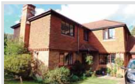
Oakwood Rise, Caterham £2,500pcm Family home located on a quiet road close to local amenities. EPC: D Hamptons Caterham & Oxted 01883 759489