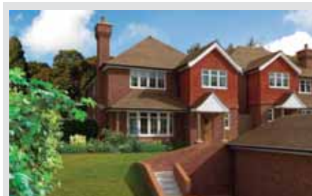
Caterham Guide Price £750,000 Stunning 4 bedroom family house near Caterham School. EPC: B Hamptons Caterham & Oxted 01883 759487