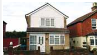
WARLINGHAM £330,000 FREEHOLD

Well presented and sought after Edwardian semi-detached house with pretty cottage style gardens in cul de sac location close to Village centre. 3 bedrooms and family bathroom to first floor. Ground floor cloakroom, well equipped kitchen, lounge, large dining room and conservatory. Loft conversion potential, stpp. Warlingham Office • 01883 622258