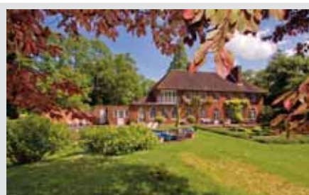
Rockshaw Road, Merstham £5,000pcm A substantial, elegant and imposing detached period residence. EPC: D Hamptons Caterham & Oxted 01883 759489