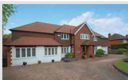
Grimwade Avenue, Whitgift Foundation Estate £3,750pcm Beautiful family home on the Whitgift Foundation Estate. EPC: D Hamptons Caterham & Oxted 01883 759489