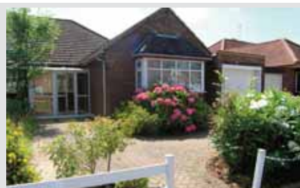
Shelton Avenue, Warringham £1,295pcm Spacious 3 bedroom bungalow renovated in 2011. EPC: E Hamptons Caterham & Oxted 01883 759489