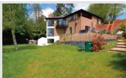
Rockfield Road, Caterham £2,995pcm Unique five bedroom family home with breath taking views. EPC: B Hamptons Caterham & Oxted 01883 759489