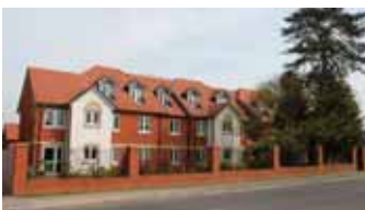
WARLINGHAM £172,500 LEASEHOLD

Offered with NO CHAIN and boasting a sizeable south facing rear garden and a garage is this family home that could benefit from some updating. EPC D. Caterham Office • 01883 347446