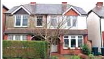
WARLINGHAM £389,950 FREEHOLD

Built in 2008, a one bedroom McCarthy & Stone retirement flat set in a popular development. Entrance hall, lounge, kitchen with appliances, bedroom and bathroom with shower bath. Many communal facilities, including gardens and car park. No onward chain. EPC B. Warlingham Office • 01883 622258