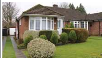
GODSTONE GUIDE PRICE £297,500

Brand new 5 bedroom detached family home located in a favoured residential road. Benefiting from kitchen/family room, utility room with appliances, cloakroom & sitting room. Landscaped gardens to front and rear and garage. EPC TBC. Warlingham Office • 01883 622258