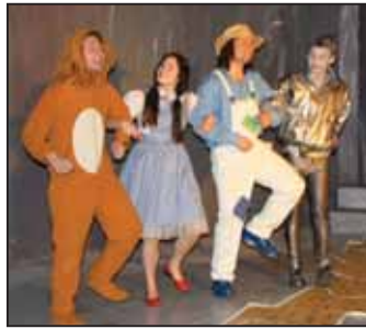
The Lion, Dorothy, the Scarecrow and the Tin Man set off on the Yellow Brick Road.