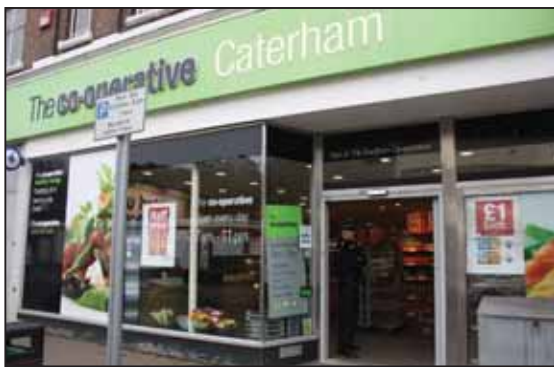
The Co-operative store in Croydon Road, Caterham Valley.