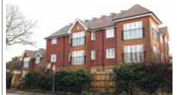
WARLINGHAM £199,950 LEASEHOLD

Modern detached 3 bedroom house in sought after location very close to village centre. 3 bedrooms, bathroom with additional shower cubicle to first floor. Large lounge/dining room with French doors leading to rear courtyard garden. Well fitted kitchen/breakfast room. Paved garden to front. Warlingham Office • 01883 622258