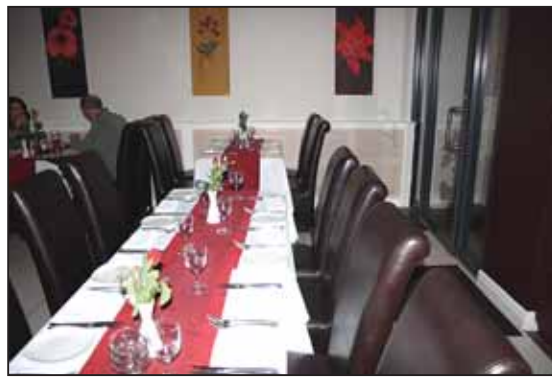
The stylish interior of Dewan-E-Am.

As we nibbled on some lovely warm papadams we perused the menu, trying to decide whether or not to order a starter or have an extra side dish with our main courses instead. The 'Special Platter' starter caught our eye, so we decided to order one to share as an appetiser. The dish consisted of tender pieces of Chicken Tikka, Lamb Tikka and a Sheekh Kebab, just the right amount for us to share, beautifully presented