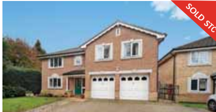
KENLEY 020 8668 1000

Five double bedroom house in favoured residential road. Sold - Similar properties required.