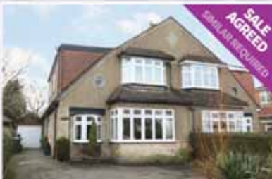
Caterham Hill £475,000

A four bedroom detached family home with driveway garage and enclosed rear garden situated in the popular village of Kenley. Viewing highly recommended. UPC1285 EPC Rating D