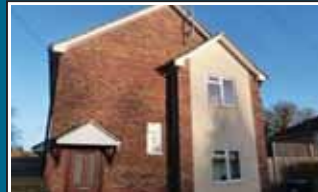
Blindley Heath - £695pcm

Wonderful one bed top floor flat in town centre. Walking distance from shops and station. Bright and spacious. New carpets and recently redecorated. Available now unfurnished.