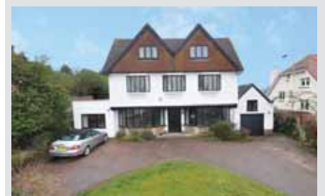
Oxted OIEO £1,325,000 6/7 Bedrooms, 5 Reception Rooms, 3 Bathrooms. EPC: E Hamptons Caterham & Oxted 01883 759487