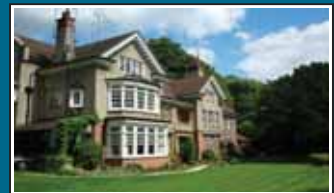
Caterham Valley - £1100pcm

Call in to speak to us and experience our tailor made, friendly and efficient service.