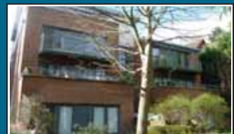
Kenley - £1195pcm

2/3 bed top floor flat in conversion property in a sought after location. Walking distance to shops and station. Allocated parking. Available unfurnished.