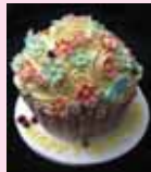
A Happy Birthday cupcake by Elizabeth George Cakes.

Everyone who enters will be offered a 10% discount for their first cake order from Elizabeth George Cakes.