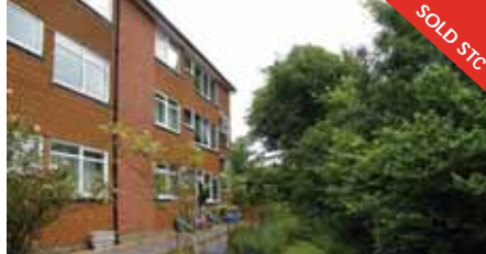
CATERHAM 01883 349114

Two bedroom ground floor flat close to town and station. Sold at open house. Similar property required for disappointed buyers.