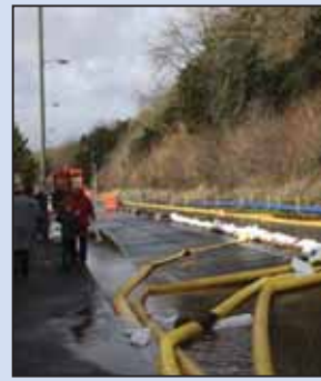
Croydon Council declared a major incident and Purley flooded, threatening to close the A22 and work on the A23. In Godstone, the Engineering there was no risk to the local flat out to protect the works.