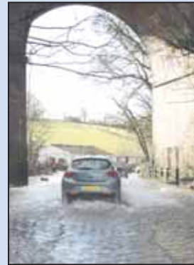
The flood beneath the viaduct in Woldingham.

Sam Gyimah also expressed his support, saying he would do all he could to ensure business owners received financial assistance from the government.