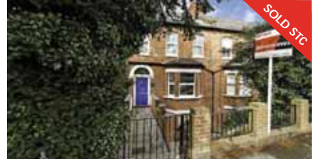
CATERHAM 01883 349114

A one bedroom ground floor, conversion flat close to shops and transport links. Similar property required for disappointed buyers.