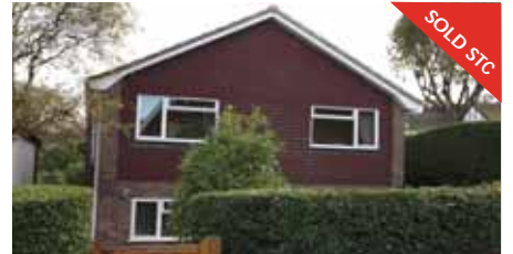
KENLEY 020 8668 1000

Four bedroom detached close to two stations and Kenley Common. Sold in Open House - similar properties required for disappointed buyers.