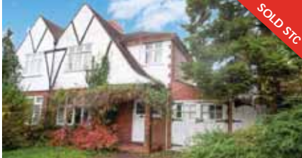
CATERHAM 01883 349114

A three bedroom semi detached house in need of substantial updating. Sold at open house. Further property required for disappointed buyers.