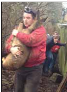
A member of the Wildlife Aid team carries the frightened young deer away from the ditch.

crew were able to catch her and safely secure her fore and hind legs to avoid injury. She was then put in a sleeping bag, carried to a vehicle and transported to Kenley Common where she was released.