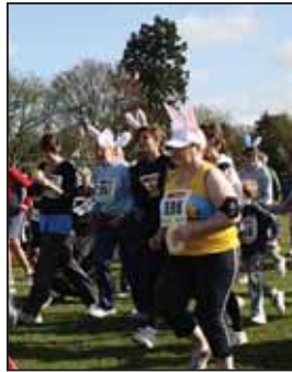
Runners setting off on the 1K Bunny Fun Run.

Caterham Rotary Club is encouraging local charities, groups and businesses to