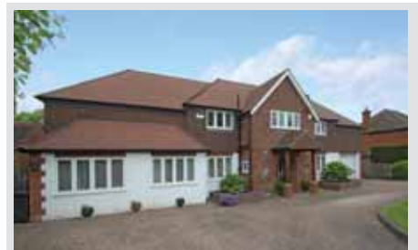
Grimwade Avenue, South Croydon £3,750pcm Beautiful family home in the Whitgift Foundation Estate. EPC: D Hamptons Caterham & Oxted 01883 759489

Hamptons Caterham & Oxted Sales. 01883 759487 Lettings. 01883 759489