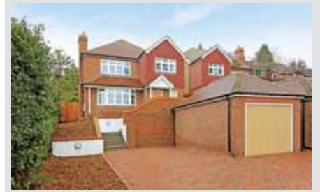
Caterham Guide Price £750,000 Stunning brand new family house near Caterham School. EPC: B Hamptons Caterham & Oxted 01883 759487