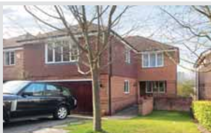
Deerswood Close, Caterham £2,250pcm 4 bedroom family home, located near Caterham town centre. EPC: D Hamptons Caterham & Oxted 01883 759489