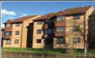
Whyteleafe - £700pcm

Ideal for commuters! Ground floor one bedroom flat located within minutes walk of Upper Warringham and Whyteleafe stations. Allocated parking.