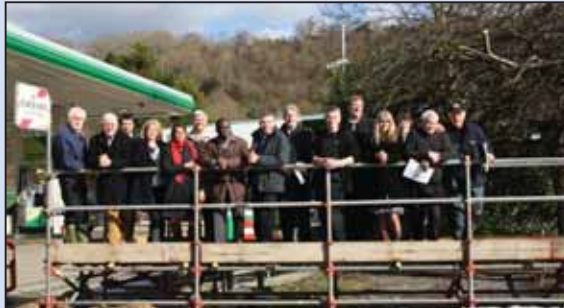
Sam Gyimah MP with business owners and representatives of Tandridge District Council on 'Whyteleafe Pier', the temporary scaffold walkway erected by Formark Scaffolding.