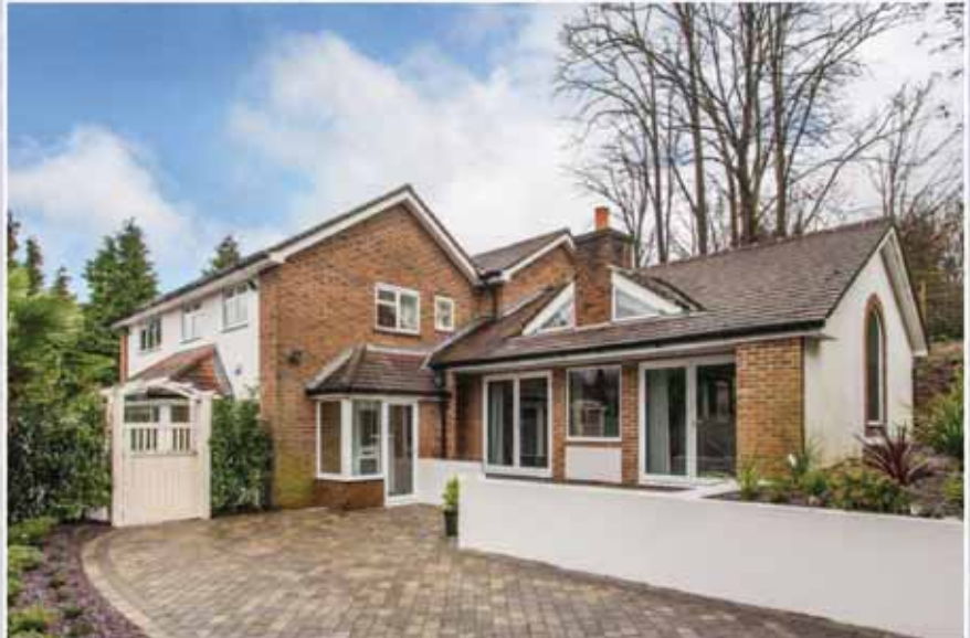
Caterham Valley £695,000

An opportunity to acquire a rarely available and highly sought after four bedroom 1330's semi detached property with well established level rear garden, driveway and garage. Viewing highly recommended. UPC1294 EPC Rating E