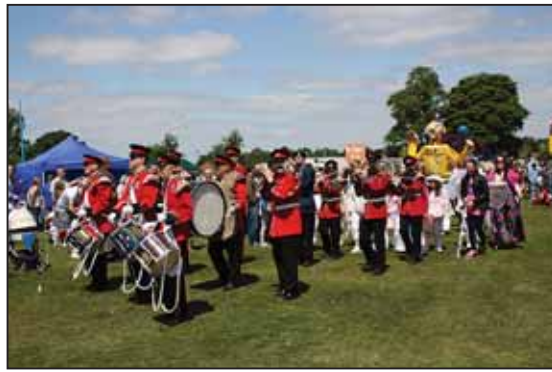
The Caterham Carnival is one of the many popular events that relies on the support of a team of volunteers.

There are many people in the Caterham area who already assist at events and functions in various ways. Some are willing to stand and direct people or traffic whilst others prefer to sit and talk. Some people, for various reasons are unable to volunteer on a regular basis and don't want to sit on a committee but would still like to be involved on an irregular basis with community events. With this in mind my volunteer friends and I decided to launch 'Team Caterham'. When volunteers are required for an event, an e-mail will be sent out to everyone signed up to Team Caterham, asking for volunteers to assist. There is no compulsion to volunteer for any of the events but we hope that everyone will volunteer at least once a year. Volunteers will be required for a variety of events, so you could be looking after a road closure at the Caterham Festival Street Party, helping