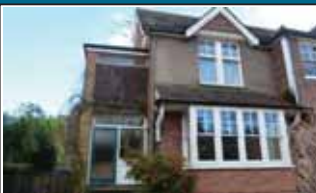
Caterham Valley - £1000pcm

Newly refurbished 2 bed ground floor flat with garage located within walking distance of Whyteleafe South, Whyteleafe and Upper Warringham stations. Available unfurnished.