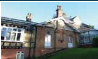
Caterham Valley - £1350pcm

2 bed stylish ground floor apartment. Recently refurbished. Modern kitchen and bathroom. Non restricted parking. Available now unfurnished.