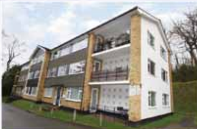
Caterham Valley £215,000

Open House Saturday 1st March Strictly By Appointment. A stunning five bedroom detached family home, situated on a private road, having its own gated entrance and occupying a well established and fully landscaped plot with spacious driveway and double garage. UPC1297 EPC Rating D