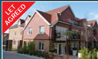
Caterham on the Hill - £1300pcm

Fantastically located for Edenbridge station, this is a spacious refurbished 2 double bedroom first floor maisonette with a good sized private garden with shed.