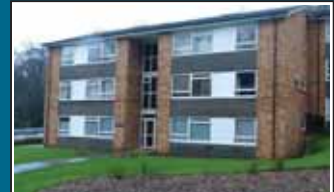
Whyteleafe - £895pcm

1 bed first floor maisonette. Extremely spacious. Open plan kitchen/lounge. Storage cupboard and loft space. Small courtyard. Allocated parking.