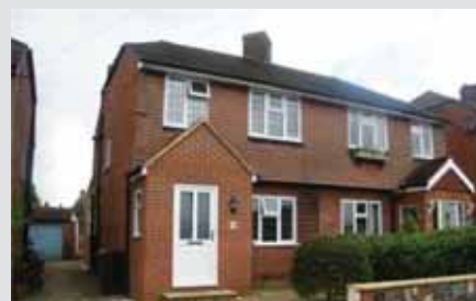
Canons Lane, Burgh Heath £1,495pcm A 3 bedroom semi detached home offering beautiful views. EPC: D Hamptons Caterham & Oxted 01883 759489