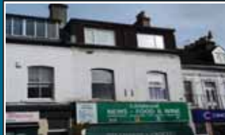
Caterham Valley - £700pcm

Ideal for commuters! Ground floor one bedroom flat located within minutes walk of Upper Warringham and Whyteleafe stations. Allocated parking.