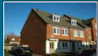
Kenley - £1395pcm

2 double bedroom apartment in convenient location. Walking distance to train station. Balcony. Allocated parking. Available now unfurnished.