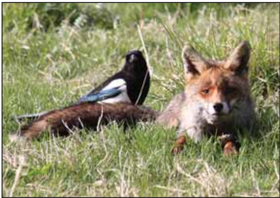
Fox and Magpie.