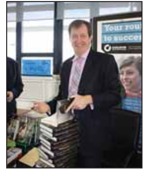
Alastair Campbell signing copies of his book at Coulsdon College.