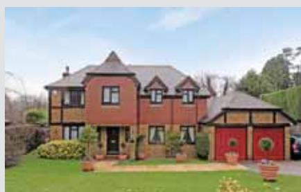
Caterham Guide Price £975,000 A spacious 5 bedroom family house near Caterham School. EPC: D Hamptons Caterham & Oxted 01883 759487