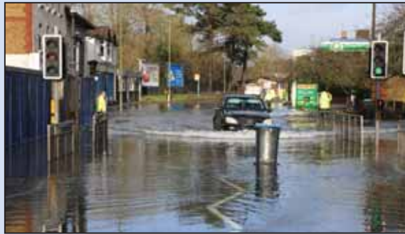
A car driving too fast through the floodwater, causing contaminated water to flow into homes and businesses.