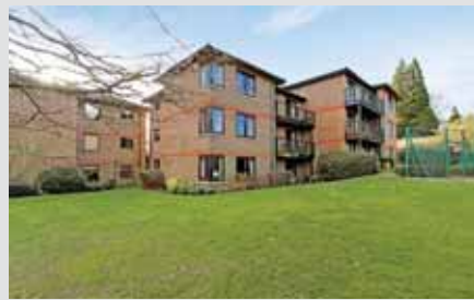
Warringham Guide Price £385,000 Spacious 2 bedroom apartment overlooking Caterham. EPC: B Hamptons Caterham & Oxted 01883 759487