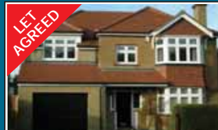
Caterham on the Hill - £1795pcm

Spacious 2 double bedroom first floor executive apartment with balcony. Fully fitted kitchen. Walk in wardrobe and en suite bathroom to master bedroom. Available unfurnished.