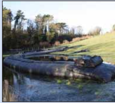
Major incident on Thursday 6th February when Kenley closed the Kenley water treatment works. Emergency services worked round the clock to prevent the works from flooding. The Director for Sutton and East Surrey Water said that the water supply and that all the agencies were working