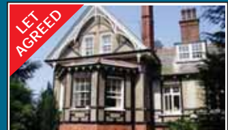
Caterham Valley - £1400pcm

Stunning 4 bedroom detached property in popular road with level garden to rear, off street parking for 2/3 cars and integrated garage with electric doors.