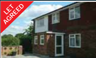
Edenbridge - £850pcm

Fantastic 1 bed apartment with large spacious lounge. Kitchen. Double bedroom overlooking lounge (mezzanine). Perfect for single professional. Walking distance of station and town.