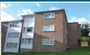
South Croydon - £1195pcm

2 double bed ground floor maisonette with private garden and conservatory. Spacious lounge. Gated parking. Available unfurnished.