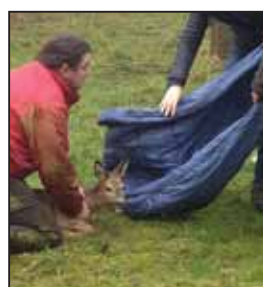
The deer is placed into a sleeping bag for safe transportation.

For more information about Wildlife Aid, to make a donation and to view films of recent animal rescues visit www.wildlifeaid.org.uk