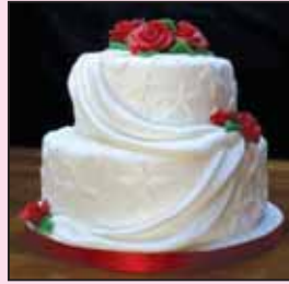
A bespoke wedding cake by Elizabeth George Cakes.

E-mail your answer to info@caterham-independent.co.uk with 'Mother's Day Cake Competition' in the subject heading. Please include your name, address and daytime telephone number. Entries can also be sent on a postcard to: 'Mother's Day Cake Competition, The Caterham and District Independent, The Officers' Mess, Coldstream Road, Caterham CR3 5UX.' Entries must be received by 5pm on Friday 14th March.