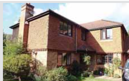
Oakwood Rise, Caterham £2,500pcm 4 bedroom family home with great proximity to local amenities. EPC: D Hamptons Caterham & Oxted 01883 759489