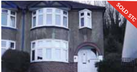
KENLEY 020 8668 1000

Three bedroom semi detached house, sought after residential road. Sold at open house. Further property required for disappointed buyers.