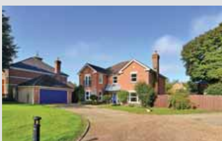
Warringham Guide Price £895,000 Contemporary family home with a beautiful setting in Great Park. EPC: D Hamptons Caterham & Oxted 01883 759487