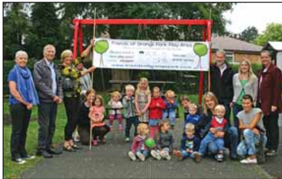
Members of the Friends of Grange Park Play Area and their children launch their new banner in Grange Park.

For further information e-mail friendsofgrangepark@gmail.com