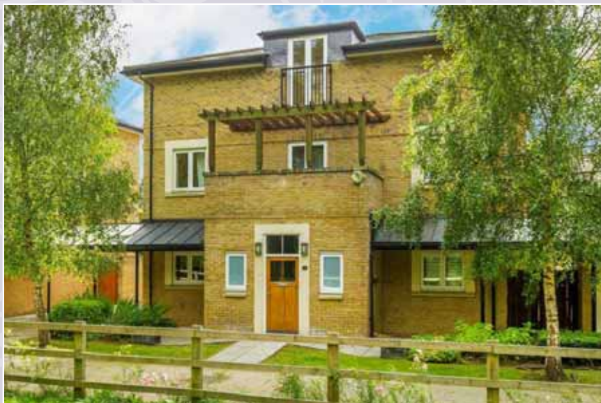
Caterham Hill £735,000

A larger than average two bedroom retirement apartment situated in the sought after Boundary Point development offered to the market with no onward chain. EPC Rating C UPC1446