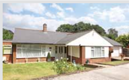
Beechcroft Avenue, Kenley. Guide price £600,000 A well presented 4 bedroom bungalow close to train station. EPC: D Hamptons Caterham & Oxted 01883 759487