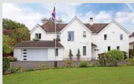
Redvers Road, Warringham. Guide price £995,000 Ideal 4 bedroom family house with superb situation. EPC: D Hamptons Caterham & Oxted 01883 759487