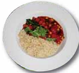
Ratatouille, spinach and chickpea stew with rice.

Musical members of the audience are welcome to play the piano before or after the night's professional entertainment, which is all