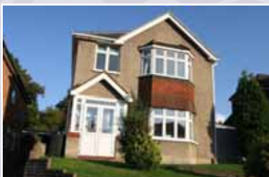
Caterham Valley £485,000

An opportunity to acquire a stunning two bedroom top floor purpose built apartment with Juliet Balcony and two allocated off street parking spaces situated in the highly sought after Eothen Close development in the prestigious Harestone Valley area of Caterham. EPC Rating C UPC1442