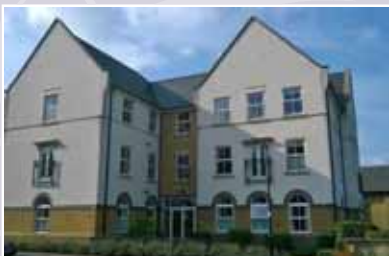
Caterham Hill £339,950

An opportunity to acquire a stunning detached residence boasting three good sized bedrooms all of which are ensuite and beautifully maintained landscaped front and rear gardens situated in a prime position within the highly sought after Hambleton Park development. EPC Rating D UPC1444