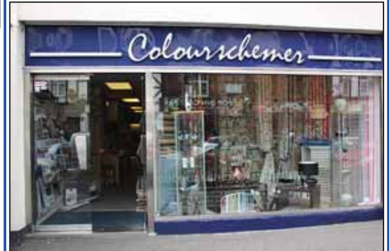
The Colourschemer store in Croydon Road, Caterham.

We are a leading interior design specialists based in Caterham and also have an extensive showroom in Haywards Heath, making us the premier soft furnishing and interior design retailer in the South East. We are a family business, having been retailers of top quality soft furnishings, curtain fabrics, cushions, wallpapers, paint, carpets, accessories, furniture, blinds, curtain tracks and poles since 1975. With our wealth of experience in the field of soft furnishings, home interiors and design, we are able to offer the best possible products and service available in the UK by combining our unique blend of knowledge and skills developed over the last 40 years. We work with leading suppliers in each field and use only top quality products and first class designs, to achieve the ultimate in interior design for the home. Working with you to interpret your ideas and tastes, we will help you create the home you deserve. Custom-made soft furnishings are an excellent investment, enhancing your property and giving years of pleasure in the process. Our product knowledge in the interior furnishings industry is unsurpassed; we can solve your problems and suggest solutions for your ideas. We offer a complete service from wallpaper sales to design and project management, from measuring curtains to final fitting. Visit our website: www.colourschemer.co.uk