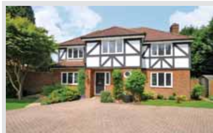
The Copse, Caterham £3,750pcm A modern detached family home located in a highly regarded close. EPC: E Hamptons Caterham & Oxted 01883 759489