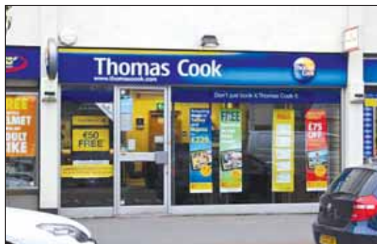
The Thomas Cook travel agent in Croydon Road where the robbery took place last year, which has now ceased trading.