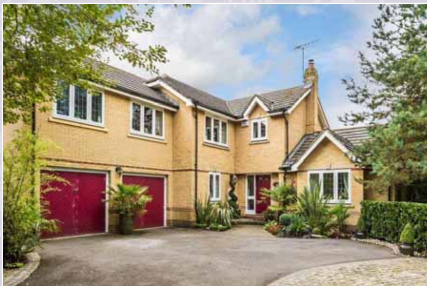
Caterham Hill £650,000

An opportunity to acquire a well presented detached house set in beautifully maintained landscaped gardens with driveway leading to double garage to rear. Internal viewing highly recommended to fully appreciate this unique family home. EPC Rating D UPC1441