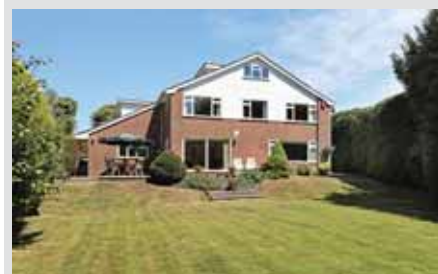
Hillbury Close, Warringham. OIEO £750,000 Substantial 4/5 bedroom family house with south facing garden. EPC: D Hamptons Caterham & Oxted 01883 759487