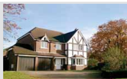
Foxon Close, Caterham £2,750pcm A superb 5 bedroom family home in this popular development in Caterham. EPC: D Hamptons Caterham & Oxted 01883 759489