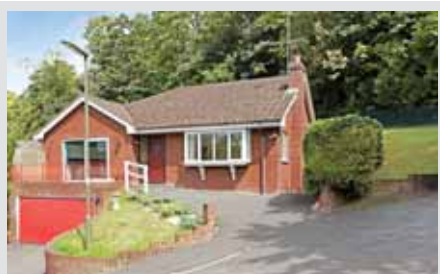
Southview Road, Warringham Guide price £398,000 A 2 bedroom bungalow in a private road convenient for transport. EPC: F Hamptons Caterham & Oxted 01883 759487