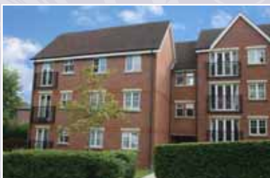
Caterham Valley £249,950

An opportunity to acquire a stunning two bedroom top floor purpose built apartment with Juliet Balcony and two allocated off street parking spaces situated in the highly sought after Eothen Close development in the prestigious Harestone Valley area of Caterham. EPC Rating C UPC1442