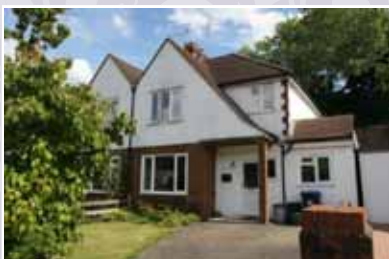
Caterham Valley POA

A stunning five bedroom detached property with contemporary open plan design situated on the unique Village development. Internal viewing is highly recommended. EPC Rating C UPC1440