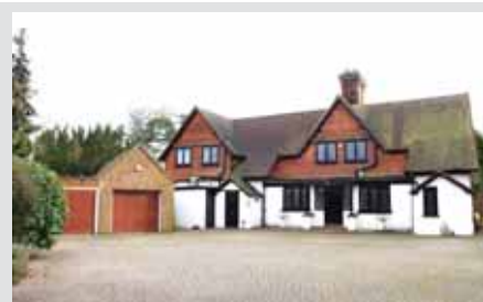
Lonesome Road, Reigate £3,250pcm A substantial period 6 bedroom house with an indoor pool complex. EPC: F Hamptons Caterham & Oxted 01883 759489