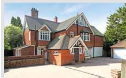
Bluehouse Lane, Oxted. Guide price £1,375,000 A substantial 7 bedroom Edwardian residence close to Oxted and its station. EPC: E Hamptons Caterham & Oxted 01883 759487