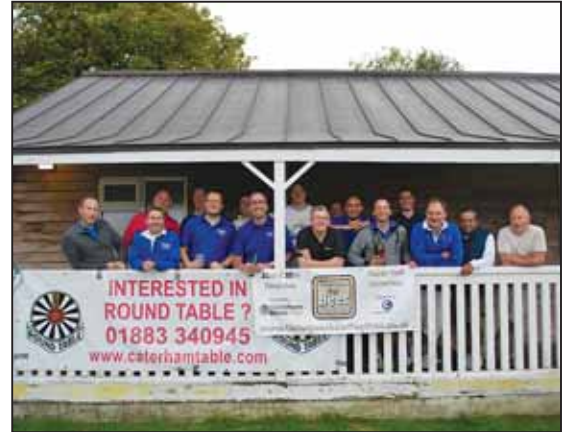
Players relaxing in the cricket pavilion after the match.

friends to enjoy because all fundraising events so this is one time when there is no fundraising involved, it is a good time doing our purely for fun."