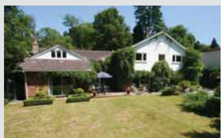
Welcomes Road, Kenley. Guide price £899,950 Superbly appointed 5 bedroom family home with secluded gardens. EPC: D Hamptons Caterham & Oxted 01883 759487