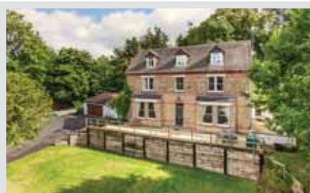
Harestone Valley Road, Caterham £3,500pcm A substantial 7 bedroom detached house. EPC: D Hamptons Caterham & Oxted 01883 759489