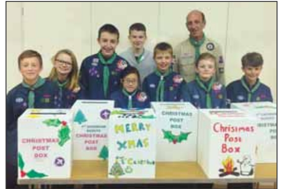
The 1st Caterham Scouts with their Christmas postboxes.

Townend. Westway Barbers, 32 Westway. Please place your cards, fully addressed with a CR3 post-