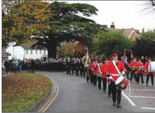
The Surrey and Sussex Drum and Bugle Corps lead the parade round to St. Lawrence's Church.