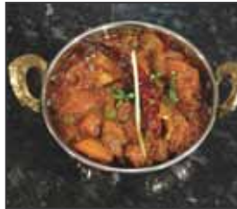
My Vegetable Kolhapuri.

before going on to one of Croydon's nightspots to celebrate the party season. It's extensive menu offers something to suit all taste and the excellent service is the icing on the cake.