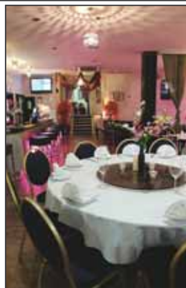
The restaurant interior.

Fushia is now taking bookings for Christmas parties and it is the perfect place to dine