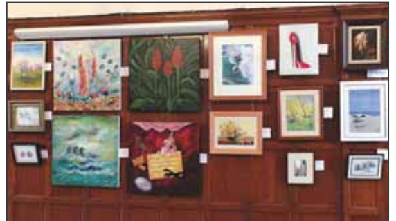
A selection of paintings by members of Caterham Art Club who were exhibiting for the first time.

New members are always welcome at the club. For more information visit caterhamartgroup.org.uk