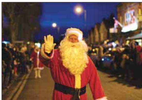
Santa greets the crowd.

After the lights were illuminated, children from Warlingham Park School, Warlingham Village School, Hamsey Green School and Whyteleafe School sang a rousing medley of Christmas songs to get everyone into the festive spirit. Many visitors took advantage of the late night opening to do some early Christmas shopping in the shops around the Green.