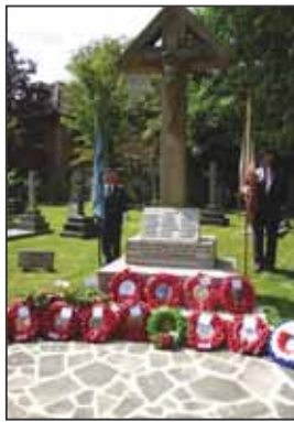
The memorial at St. Luke's Church in Whyteleafe.