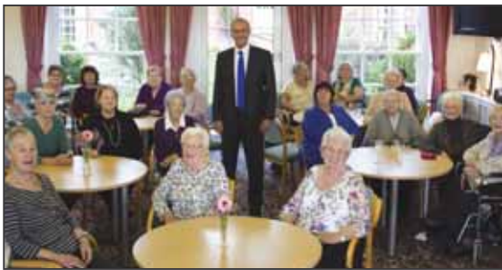
Dr. Hilary Jones with the lady residents of Le Personne Homes in Caterham on the Hill.

explained how living at the Homes has given them the confidence to live independently, with the knowledge that they have the security of a manager on site, backed up by TeleCare24's technology alarm system, 365 days a year. The ladies told Dr. Hilary how the well-maintained one-bedroom flats, provided by Le Personne Benevolent Trust, are a warm and friendly place to live with neighbours who care about each other. Dr. Hilary also joined the ladies for lunch in the beautiful lounge at Le Personne Homes, chatting informally and answering all their questions.