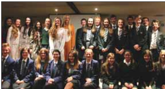
Participating Schools from 2014's challenge, top row from left: Farlington School, Tanbridge House School. Bottom row: Last year's winners, Hazelwick School (left) and Millais School.

For more information about participating in the Five-O Project call 01293 447376 or email comfun@stch.org.uk .