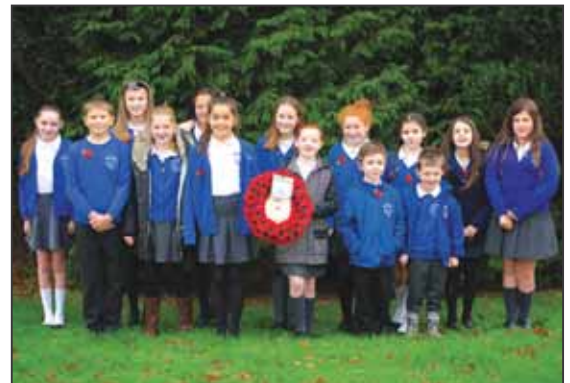
The children of Warlingham Village School get ready to lay their wreath.