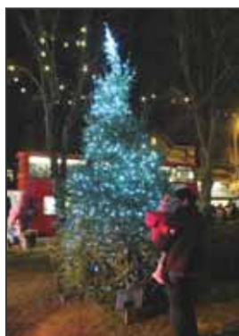
The beautiful Christmas Tree on Warlingham Green.