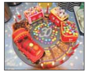
The 30th anniversary cake.