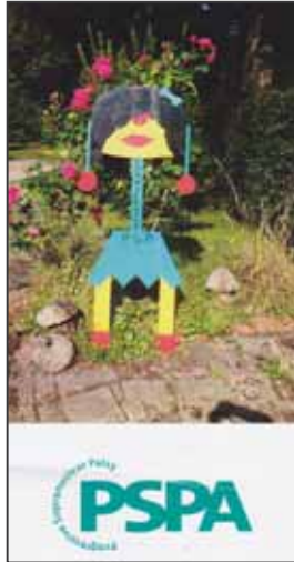
The PSPA 2016 Calendar

It was discovered that the delivery of the Bogles to Stonehenge had been part of an elaborate rag stunt by Manchester University students!