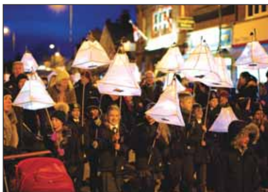
Children taking part in the lantern parade.