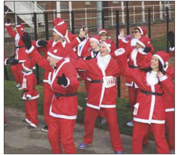
The Santas perform a dance routine to get warmed up for the St. Catherine's Santa Run at Caterham School.