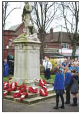
Children laying a wreath at Warlingham Memorial.