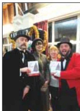
The cast of Jack the Ripper in Warlingham Church Hall.