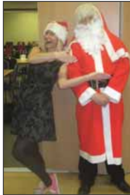
Santa and his helper at last year's Christmas lunch.

"Last year I found the experience moving, exciting, challenging and very reflective of the Christmas message."