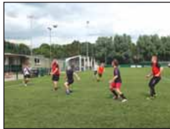
Action during the first half of the Charity Football Match.

trophy and plate were presented to the two captains.