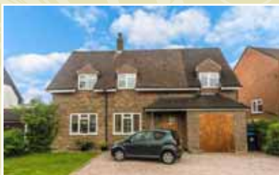
South Godstone £560,000

An attractive four bedroom detached house offered in excellent condition throughout with level rear garden situated in a popular residential road in the popular village of South Godstone. Viewing highly recommended. EPC Rating C. UPC1810