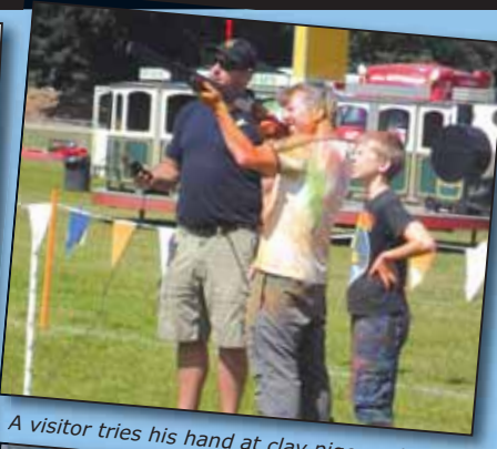
A visitor tries his hand at clay pigeon shooting.