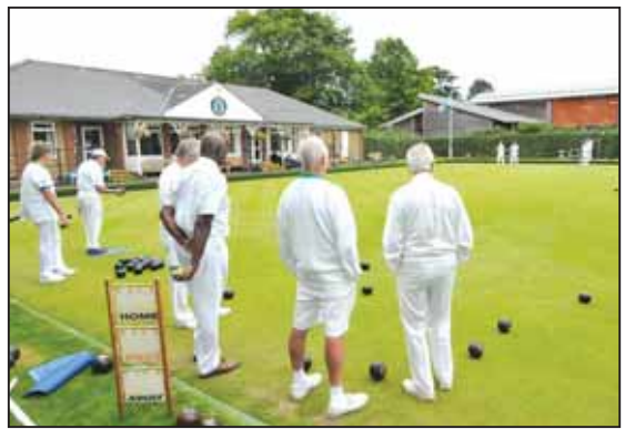
Caterham Bowls Club.