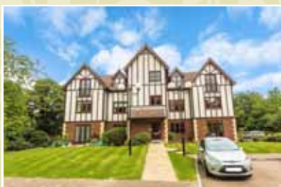
South Godstone £310,000

An opportunity to acquire a well presented two bedroom end of terrace period house with level south west facing rear garden situated in a highly sought after residential road close to local shops, transport links and schools. EPC Rating D. UPC1819