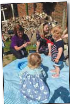
Fun in the sun with Monkey Bean at The Caterham Arms.