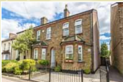
Caterham Hill Guide Price £375,000

An opportunity to purchase a desirable four bedroom detached chalet style bungalow offering versatile accommodation on a level position with driveway and garage offering further potential for development subject to planning permission and situated in sought after tree lined residential road. EPC Rating D. UPC1821