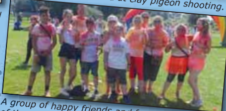
A group of happy friends and family at the end of the Colour Run.