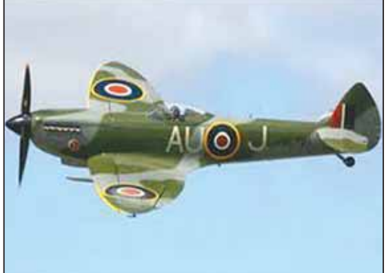
The Supermarine Spitfire.