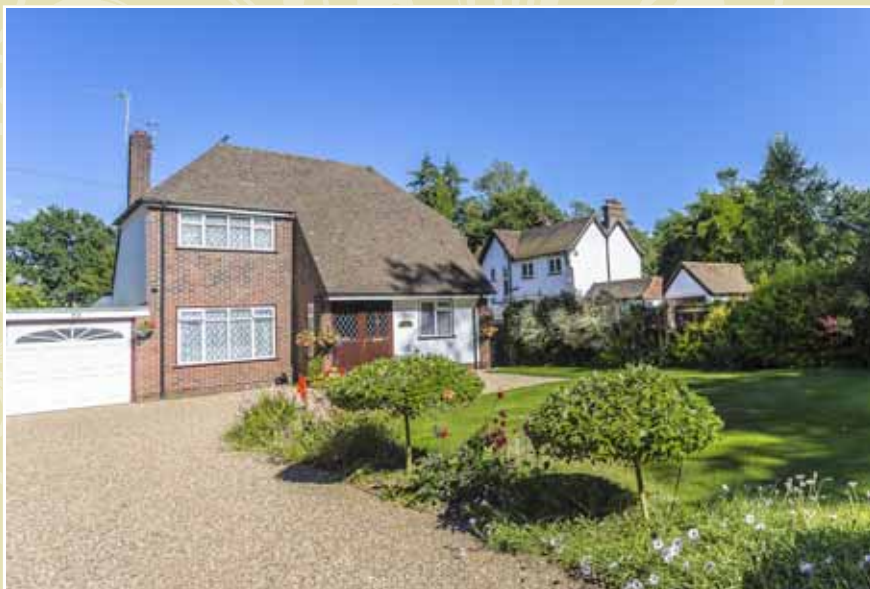
Caterham Hill £725,000

A three/four bedroom town house with driveway to front occupying a secluded and tucked away position within an exclusive private cul-de-sac. EPC Rating TBC. UPC1830