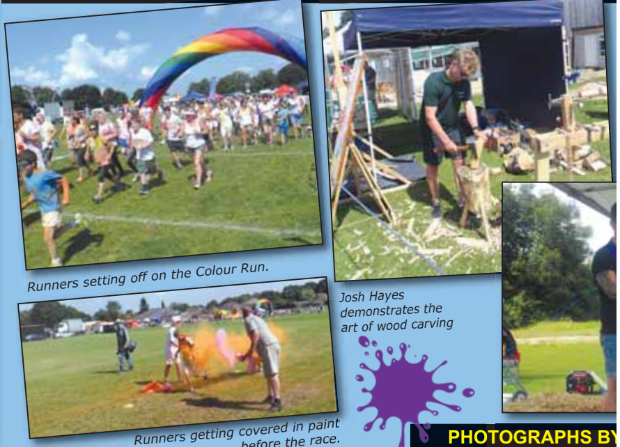
Runners setting off on the Colour Run.