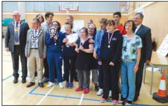
Participants pose with their awards at the end of the competition at Oasis Academy Coulsdon.