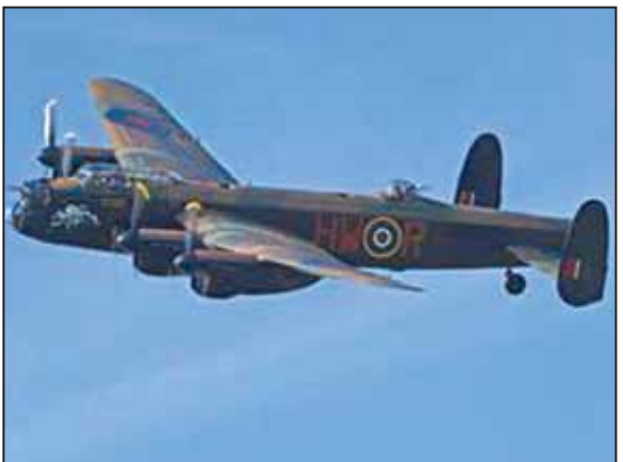
The Avro Lancaster.

The Battle of Britain Memorial Flight will be making their annual flypast over Kenley Airfield adjacent to Hayes Lane in Kenley on Sunday 14th August at 12.40pm. Providing the weather conditions and the aircraft are suitable, they will be commemorating the "Hardest Day" during the battle of Britain, in which RAF Kenley played a major role on 18th August 1940. Coincidentally, this year is the 80th anniversary of the maiden flight of the Supermarine Spitfire and the 75th anniversary of the test flight of the Avro Lancaster. Both of these aircraft will be accompanied by that other icon, the Hawker Hurricane. Give yourselves plenty of time to get there because times are subject to alteration and do not forget to wave! Please keep to the RAF Kenley Tribute side of Kenley Common to comply with safety requirements. There are no parking facilities on the airfield.