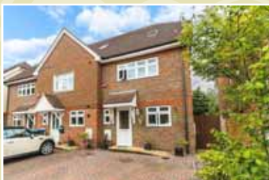
Caterham Hill £490,000

An attractive four bedroom detached house offered in excellent condition throughout with level rear garden situated in a popular residential road in the popular village of South Godstone. Viewing highly recommended. EPC Rating C. UPC1810