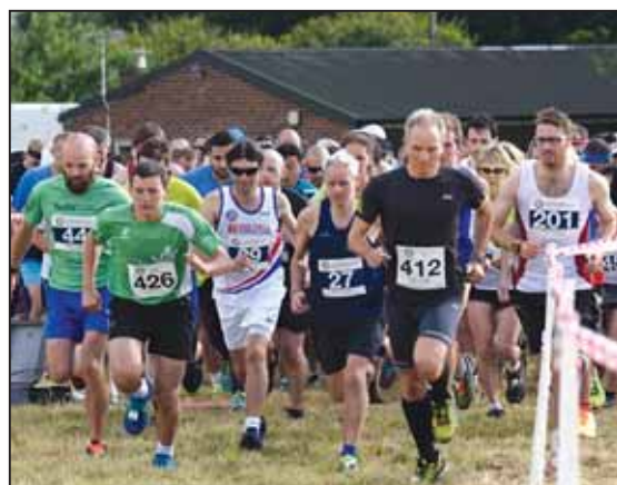
Runners set off on the Half Marathon.

making a donation to the charity Cardiac Risk in the Young. In addition to our main sponsor, North Downs Hospital, we would also like to thank the following organisations for their help and support leading up to the event and on the day: Redhill Aerodrome, Waitrose (Caterham), Caterham Photography, Bunny Hop Dance and Fitness, Nice Work Race Management, AZ Maps, Raynet Communications, La Pergola Restaurant in Whyteleaf and St John Ambulance. For the full results visit www.caterhamrotary.org.uk