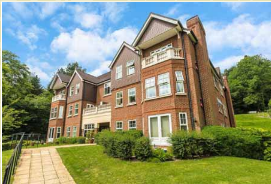
Caterham Valley £499,950

A two bedroom purpose built top floor luxury apartment with Juliette balcony, lift service and off street parking situated in well established communal grounds and gardens. Viewing highly recommended. EPC Rating C. UPC1829