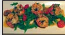
The King Prawns.

quality, local produce and flavoured expertly with fresh herbs and spices. We ordered a bottle of house white wine to go with our meal, which was a refreshing bottle of Pino Grigio. The service throughout the evening was excellent, with Marco keeping us informed of the wonderful combination of ingredients used in