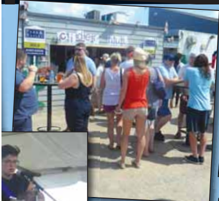
Visitors throng around the cider hut.