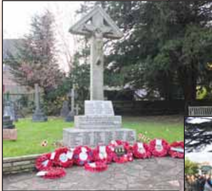
Right: The annual Remembrance Sunday parade in Caterham-on-the-Hill that marches from the Ex-Servicemen's Club in Townend round to St. Lawrence's War Memorial for the laying of the wreaths, followed by the service in St. Mary's Church.