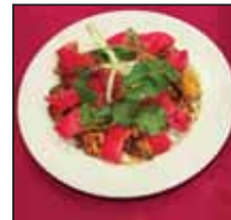
The Chef's Special Vegetables is a delicious combination of cauliflower, aubergine and carrot crowned with red pepper cooked in a clay oven, with Paneer cheese creating additional flavour and texture.