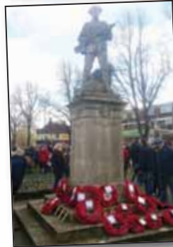
Warlingham War Memorial.