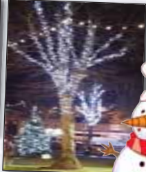
Warringham Green Christmas lights.