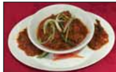
The beautifully-spiced Vegetable Kofta is a traditional treat for vegetarians.