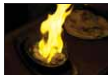
The tasty Lamb Juliet arrives at the table in spectacular fashion!