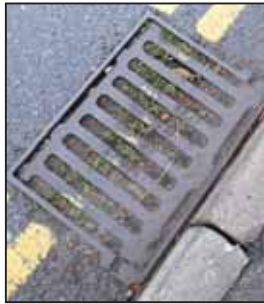
A recent photo of a blocked drain in the High Street, Caterham-on-the-Hill.

The incidents of flooding will continue to rise, more houses will be at risk if urgent action is not taken. The last one affected 80 properties, next time it could be your home."