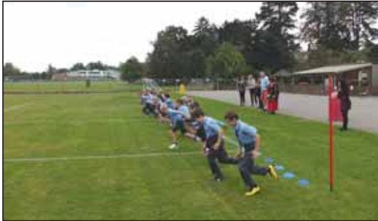
The St. Francis' pupils setting off on their 100 metre sprint.