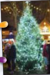
The beautiful Christmas Tree on the Green.