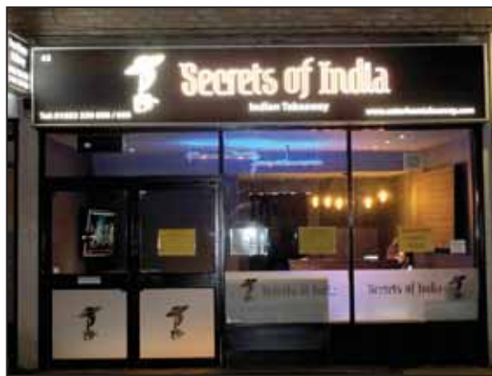
The new Indian takeaway in Croydon Road.