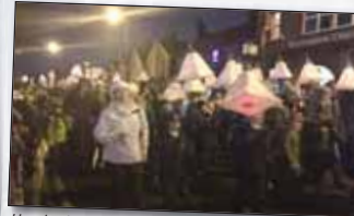
Hundreds of people led by Warringham Flute Band took part in the traditional Lantern Parade around the Green before the switching on of the lights