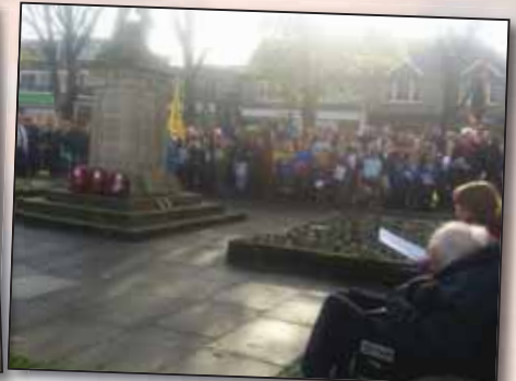
The crowd pay their respects on Warlingham Green.