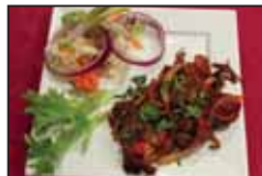
The tender and juicy Lamb Chops.