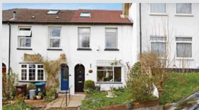
Mount Pleasant Road, Caterham £350,000

Character 3 bedroom cottage within a convenient location close to the town centre and train station. EPC E