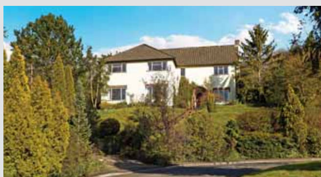
Deansfield, Caterham Guide price £750,000

This 5 bedroom detached home offers a double garage, garden and views across Caterham Valley. EPC C