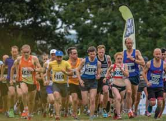
Runners set off on last year's Rotary Half Marathon.