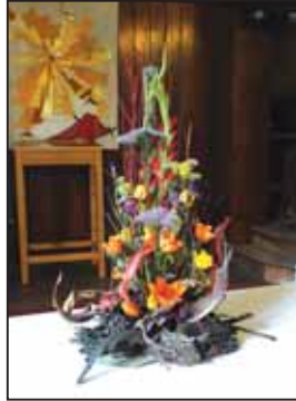
"St. Joan of Arc" by Chaldon and Caterham Floral Club.

On Friday 10th June the church is hosting a Comedy Night at 7.30pm as part of its anniversary celebrations. Tickets cost £10 to include a glass of wine and are available by e-mailing stmaryscaterham@gmail.com or calling 01883 348751.