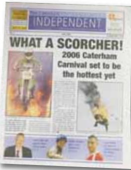
The front page of the June 2006 edition of The Caterham Independent.

The name of the paper was soon revised to The Caterham and District Independent to take account of our distribution to Caterham's neighbouring towns. The first edition of the paper