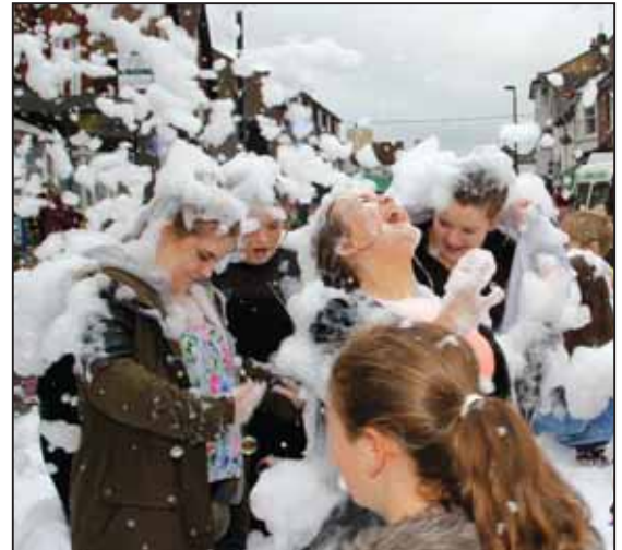
The Foam Fight at last year's Street Party. This year the Street Party in the High Street, Caterham-on-the-Hill, is taking place from 1pm-6pm on Sunday 5th June.