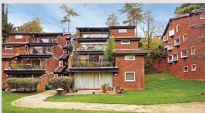
Southview Road, Warlingham 379,950

A stunning 3 bedroom penthouse apartment with garage and far reaching views. EPC D