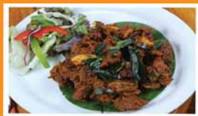
Lamb Coconut fry - Marinated lamb with ground pepper & coconut

Keralites love their food and for them cooking and sharing a meal with a guest is the ultimate sign of hospitality.