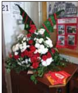
"St. George" by the pupils of Hillcroft Primary School.