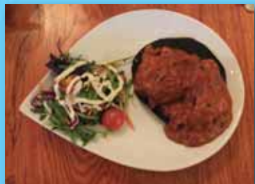
The Boiled Egg Roast starter

For our main courses, Jenny had the Neerulli Prawn Curry made with King Prawns and cooked in a special sauce made with shallots. It is one of the chef's special dishes and went beautifully with our side dishes of Mushroom Masala and Beetroot with Coconut. I had a dish that is not on the menu - a Mixed Vegetable Curry that Jinson Paul prepared with a great selection of vegetables including green beans, carrots and potatoes. We shared a portion of Appam bread which is gluten free, made simply from rice and a small quantity of lentils. Nicole explained that the chef can adapt any dish to individual customer's tastes or dietary requirements, if they have a nut allergy for example, as every meal is freshly prepared once it has been ordered.