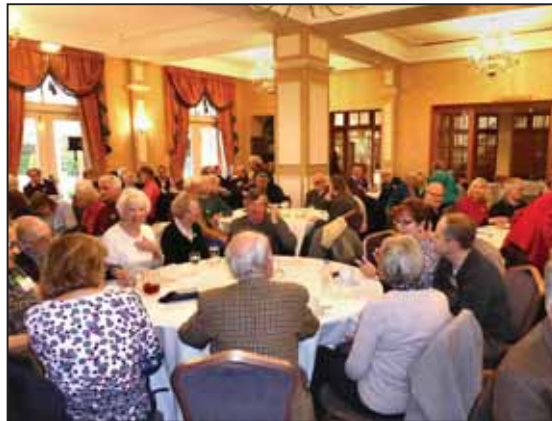
Members enjoying the Diamond Jubilee celebration at the Coulsdon Manor Hotel.