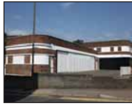
The derelict site in Croydon Road, Caterham.

On Thursday 28th April, Tandridge District Council's (TDC's) Planning Committee approved two planning applications for the redevelopment of the Rose & Young site in Croydon Road, Caterham. The first application, submitted by the owner of the site, that has been derelict for 20 years, was for 48 flats on four floors over a ground floor retail unit with basement car park beneath. The second application was for a part-four, part-five storey 107-bedroom Premier Inn hotel with a restaurant and retail unit on the ground floor, and basement car park beneath. The permission granted for the owner's scheme is subject to the owner signing a Section 106 Agreement that states that if building has not commenced within one year, the Council can re-look at the requirement to include