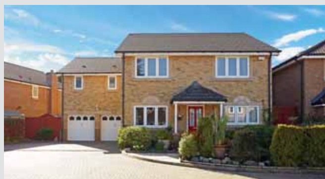
Cedar Park, Caterham OIEO £850,000

Detached 5 bedroom family home with attractive south facing rear garden, offering spacious accommodation and a double garage. EPC C