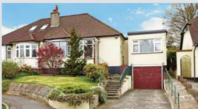
Ninehams Close, Caterham OIEO £350,000

Attractive 2 bedroom bungalow in need of modernisation situated in a popular cul de sac. EPC F