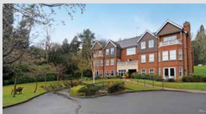
Harestone Valley Road, Caterham £450,000

A 2 bedroom apartment in a sought after development close to Caterham town centre. EPC C