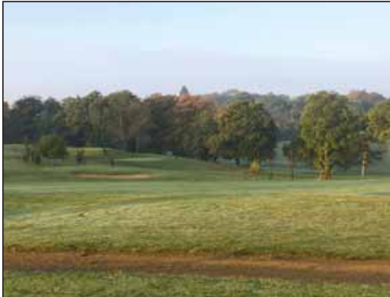
Surrey National Golf Course.