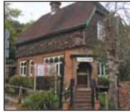
East Surrey Museum.