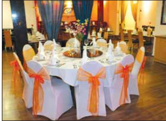
The colourful restaurant interior.