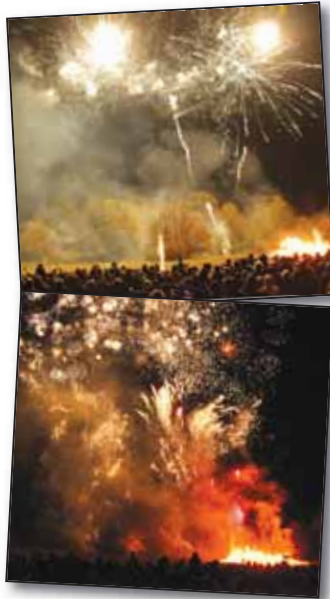
The Caterham Round Table Firework Display.

Local children are invited to enter the Build a Guy competition on the Dene Field next to Caterham Dene Hospital on the day of the display. Simply take your Guy along to the field by 1pm to be judged and the winner will win £50. All entrants will receive a free ticket to the display.