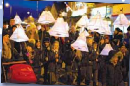
Last year's Lantern Parade.