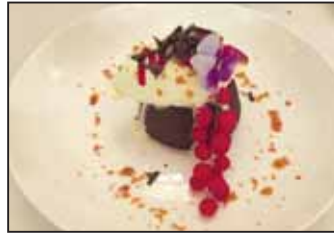
Chocolate Fondant dessert.

My starter of Roasted Heritage Beetroot came with goats cheese mousse, pickled turnips, finely sliced chestnuts and baby basil. Mum's starter of Hand-dived, Seared King Scallops came with brown shrimp, smoked