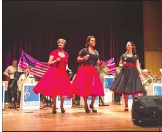
The ConChord Siblings performing a '40s number with the band.

The Tandridge Friends Committee said: "It was fantastic to see so many people enjoying the music of the ConChord Big Band. We're thrilled to support St. Catherine's and would like to thank Woldingham School for loaning us their auditorium, Barclays for supporting our raffle and W.A. Truelove & Son for sponsoring this wonderful concert. And most importantly, we'd like to thank everyone who came out to support their local hospice."