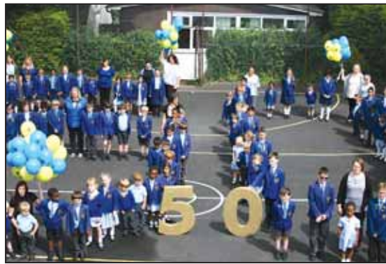
The pupils of Essendene Lodge School celebrate the school's 50 year anniversary.

The school now attracts many pupils from a wide area and it is the norm for children of previous pupils to attend this school.