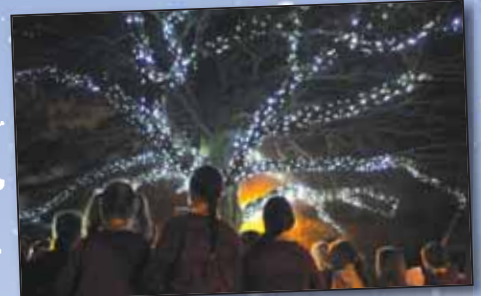
The Cedar Tree lights.