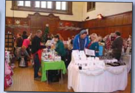
Last year's Christmas Market in the Soper Hall.