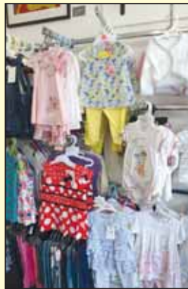
Some of the children's garments at Hilltop Trends.

The shop is open Monday-Saturday from 9am-5.30pm and has plenty of space for prams. Visit their Facebook page to see new additions to their range and customer reviews.