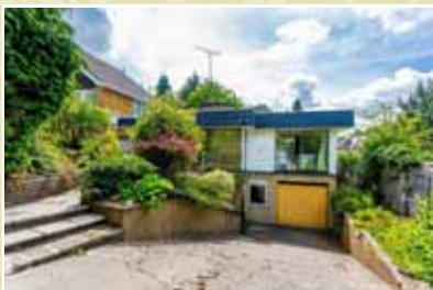
Purley Guide Price £525,000

An opportunity to acquire this unique two/three bedroom detached residence offering a contemporary style and layout in need of refurbishment situated in a popular residential road close to Purley mainline station with fast train service in to Central London. No onward chain. EPC Rating E. UPCI1831