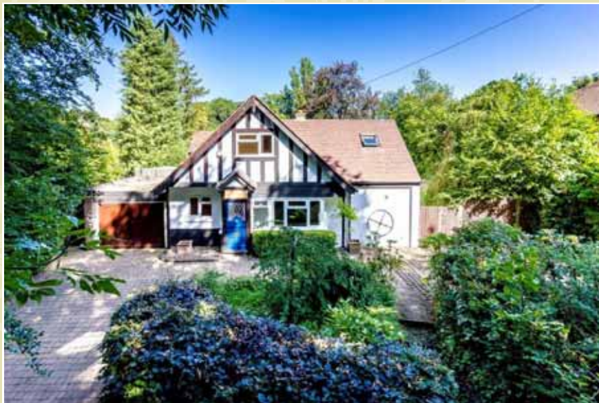
Chaldon OIEO £750,000

An opportunity to acquire an exceptional two bedroom end of terrace house with level rear garden and allocated off street parking for four vehicles occupying a prime position within the sought after Hambleton Park development. EPC Rating TBC. UPCI1750