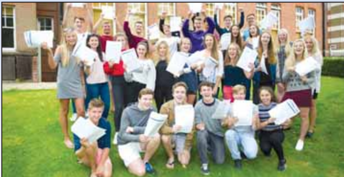
Students celebrating their A Level exam success at Caterham School.

"This strong set of results is underpinned by the hard work and commitment of both pupils and teachers, and also by an approach to education that encourages pupils to think and not just to regurgitate facts."