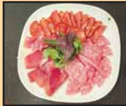
Tabla de Embutidos.