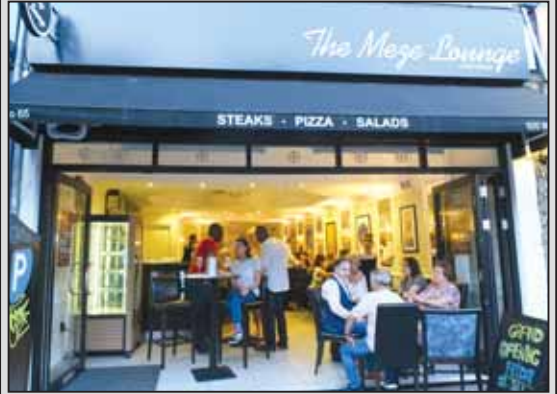
The Meze Lounge.

"The owner of The Meze Lounge has other restaurants in London that support homeless projects, so that is what inspired us to do the same thing here in Croydon".