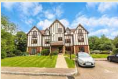
South Godstone OIEO £300,000

An opportunity to acquire a four bedroom detached chalet style bungalow occupying a well established plot of approximately half an acre situated in a highly sought after lane in the popular village of Chaldon. No onward chain. EPC Rating E. UPCI1846