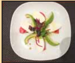
Tres Colores Salad.