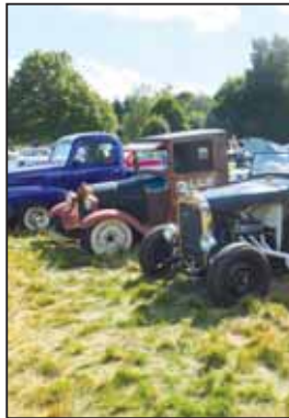
Several vintage American cars were amongst the line-up.