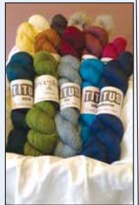
Baa Ram Ewe yarn.

Ida's House runs a programme of workshops throughout the year, for example a Crochet Toys Workshop and Sock Workshop. Further details can be found at www.idashouse.co.uk or call the shop on 01883 345220.