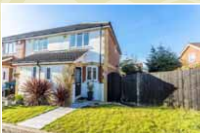
Caterham Hill OIEO £365,000

An opportunity to acquire this unique two/three bedroom detached residence offering a contemporary style and layout in need of refurbishment situated in a popular residential road close to Purley mainline station with fast train service in to Central London. No onward chain. EPC Rating E. UPCI1831