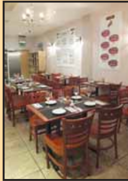
The restaurant interior.

The Tapitas choices include all the traditional favourites, including Patatas Bravas (potatoes in a spicy tomato sauce), Calamares Fritos (crispy fried squid), Chorizo al Vino (Spanish Chorizo cooked in red wine sauce) and Pollo al Ajillo (chicken in garlic sauce and white wine). The food was all cooked from fresh ingredients by Portuguese chef Domingos and was served nice and hot. The wonderful meal with the lively Latin music in the background and excellent service provided all the ingredients for a very enjoyable evening out. To book a table call 01883 345888.