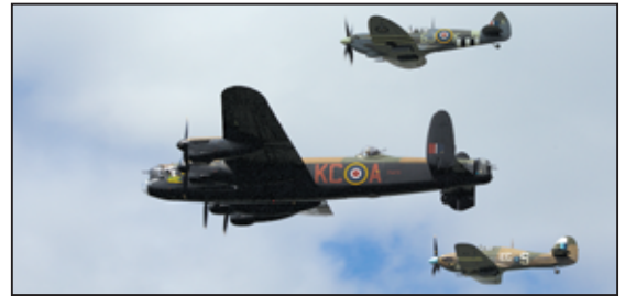
The Spitfire, Lancaster and Hurricane.