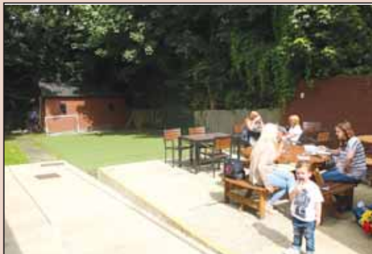
The garden at Amano Caffè & Deli.

See advert below for opening times and visit www.amanocaffedeli.co.uk for their full menu.