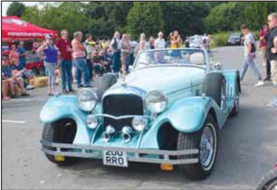
One of the many stunning cars in attendance at the Show.

For motoring enthusiasts - here are a few more photos from the South East Classic Car Show, Chelsham, Sunday 7th August 2016.