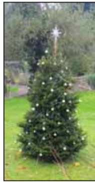
The tree in the grounds of St. Lawrence's Church donated by Knights Garden Centre.

27 beautiful Christmas trees have been on display at St. Lawrence's Church in Caterham-on-the-Hill this November for the Church's Christmas Tree Festival. The trees have been contributed by local organisations and the winners will be displayed at the Douglas Brunton Centre and Caterham-on-the-Hill Library throughout December.