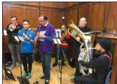
The wind section of the Redhill Corps of Drums providing the Festival entertainment.