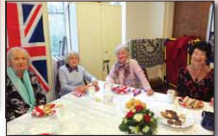
Ladies enjoying the Pinks Funeral Directors' Remembrance Day Tea in St. Luke's Church Hall.