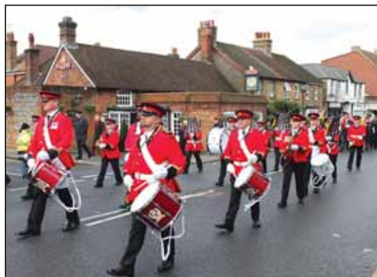
The parade in Caterham-on-the-Hill marching towards the memorial outside St. Lawrence's ancient church.