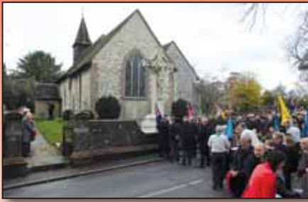
The parade in Caterham-on-the-Hill assembles in front of the memorial at St. Lawrence's Church.