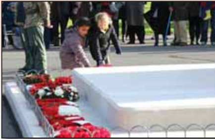
Brownies lay a wreath at the Tribute at Kenley Airfield.