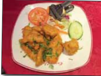
The Mixed Vegetable Pakora starter.