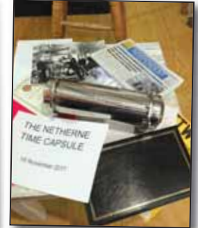
The objects going inside the time capsule included a set of coins from the present day and a copy of The Pictorial History of Netherne.