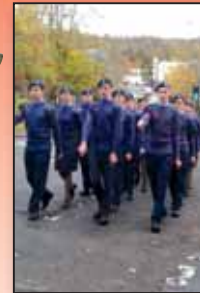
The Sea Cadets parade to St. Luke's Church in Whyteleafe.