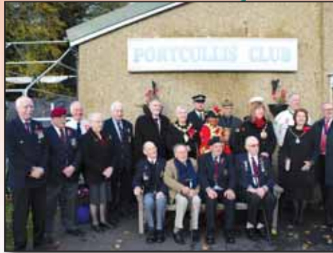
Veterans and Dignitaries at the Royal Air Force Association ("RAFA") Portcullis Club after the wreath-laying at the Tribute at Kenley Airfield.