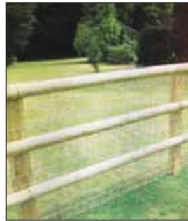
The style of the proposed new perimeter fence.

across the airfield." A public consultation on the proposals will be held when the planning applications are submitted next year.