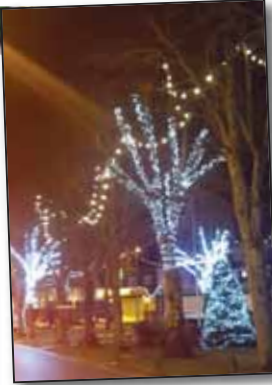
Some of the illuminated Warringham lights.