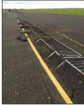
The existing unsightly crowd barriers that present a risk to safety when fallen down.