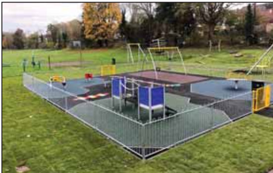
The new play area in Stafford Road.