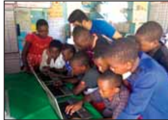
Pupils get absorbed in activities on their new laptops.

plete their education. This year we have made a commitment to 19 girls who would otherwise not have been able to complete secondary school. We want our children to have gratitude but also to know that their help can make a huge amount of difference to someone who may not have the same opportunities. It's good to see pupils exchanging letters and finding out about each other. We hope to continue to support the school so that they gain the real long term benefits of the partnership."