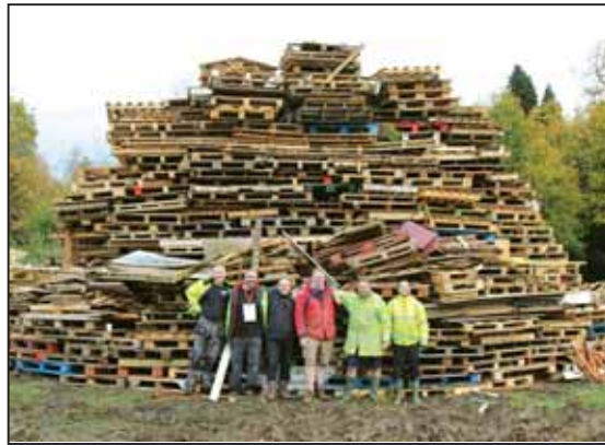
Some Round Table members with the fully-constructed bonfire in the Dene Field.