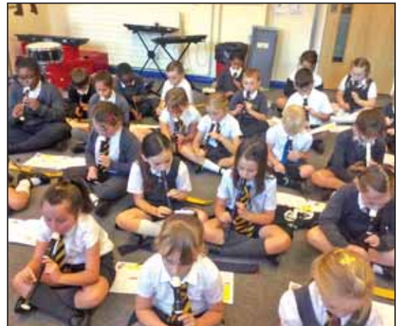
The children have the opportunity to learn a range of instruments - the whole of Year 3 learns the too (a starter flute), while Year 4 learns the clarinet. The photo above shows a recorder lesson.