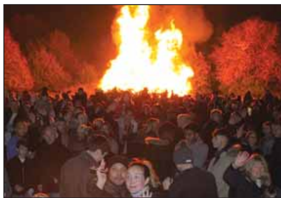
The bonfire in its full blazing glory.