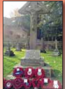
The St. Luke's War Memorial.