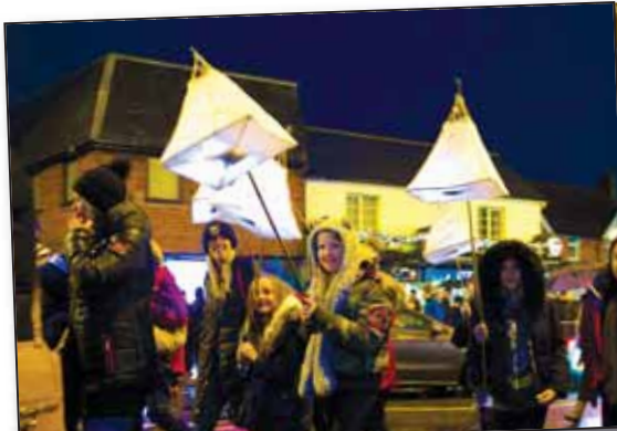
Children in the lantern parade march to Warlingham Green.