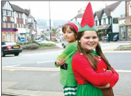
Two mischievous elves in Caterham Valley.