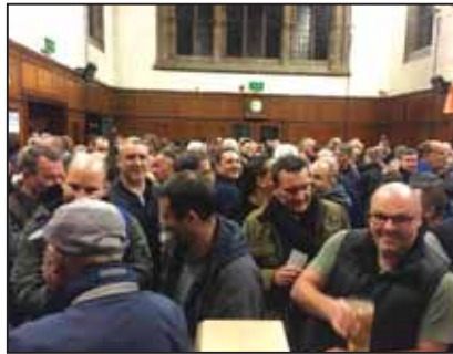
The Beer Festival crowd in the Soper Hall.

On Friday 17th and Saturday 18th November, the Soper Hall in Harestone Valley Road was the venue for Caterham Round Table's 5th annual Beer Festival where around 1,100 guests consumed over 4,000 drinks of real ale, cider and prosecco. The Redhill Corps of Drums provided the musical entertainment on the Saturday afternoon and 50 volunteers helped stage the event and man the three bars at the Soper Hall.