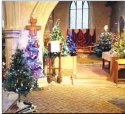
Some of the colourful trees on display in St. Lawrence's Church.