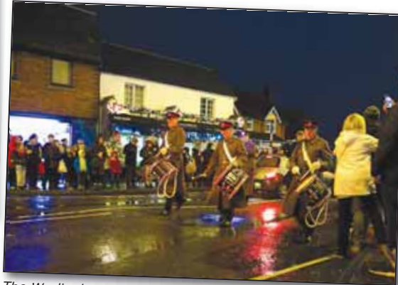
The Warringham Flute Band leads the torchlight procession.