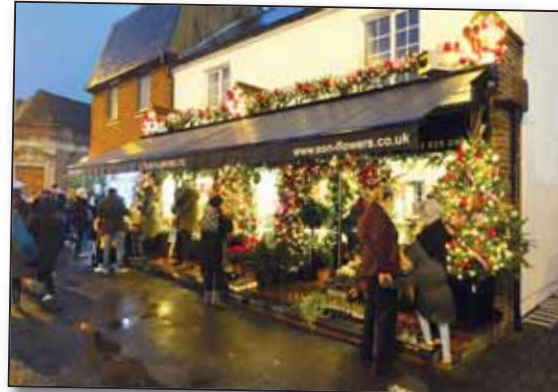
Son Flowers florists.