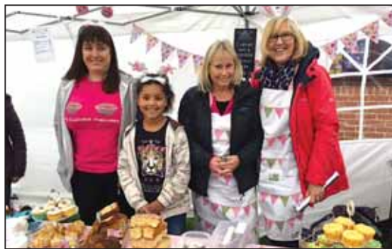
Members of Old Coulsdon Cupcakes WI at their stall at the Easter Extravaganza.