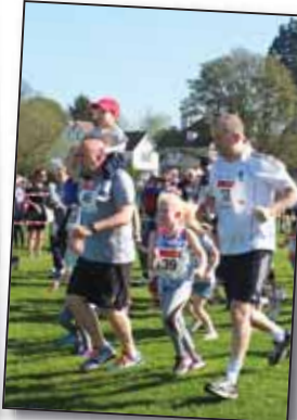
Runners setting off on the 1K Run Run.