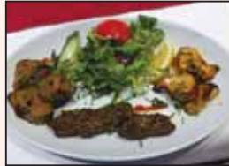
The "Special Platter" starter.

Jenny was pleased with the generous amount of chicken and described it as wonderfully mild dish, plenty of buttery sauce to mop up with our naan bread! We also shared a