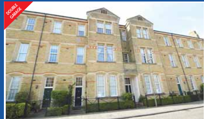
THE VILLAGE, CATERHAM ON THE HILL £559,950 F/H An impressive FOUR BEDROOM family home converted from a former barrack block and located in a tree lined wide boulevard within the popular Village Development in Caterham on the Hill. Adaptable accommodation over three floors, sunny rear enclosed garden. EPC: C Call 01883 348035 to book an appointment to view.