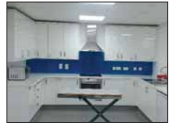
The brand new Food Technology room at Clifton Hill School.