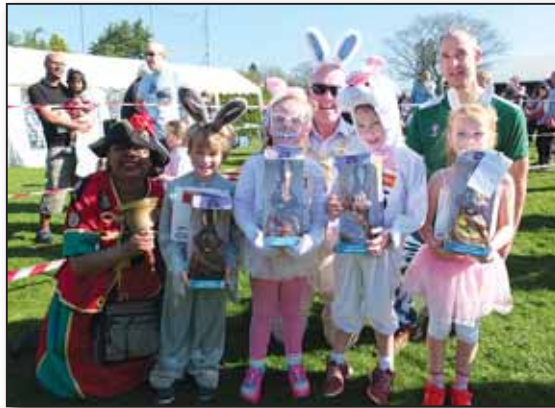
The Best Dressed Bunnies in the 1K Fun Run with their prizes.

Full results are available on the website www.rotaryruns.co.uk .