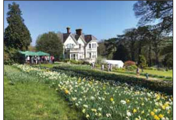
The Chalet in all its spring glory.