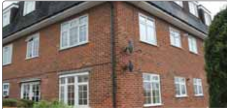
EARLSWOOD - £995 PCM Two bedroom ground floor flat, recently refurbished located within minutes' walk to Earlswood train station, unfurnished. Available now. EPC D Caterham Office • 01883 622244

Successfully Letting Properties Across East Surrey Since 1936