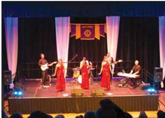
Motown Soul performing at Caterham School.