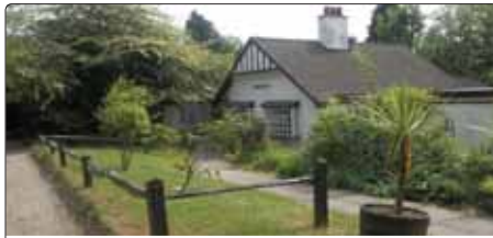
BLETCHINGLEY - £1,100 PCM Two bedroom terraced country cottage, private road, within 5 minutes' drive of Caterham town centre and train station, unfurnished. Available now Caterham Office • 01883 622244