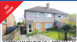
CATERHAM ON THE HILL £275,000 L/H WITH SHARE OF FREEHOLD A ground floor TWO BEDROOM maisonette with a front and rear garden plus off road parking space. Shower room / Wet Room, requires some MODERNISATION. Viewing recommended. EPC: an order. Call 01883 348035 to book an appointment to view.