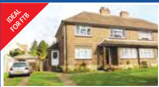
CATERHAM ON THE HILL OIEO £279,000 L/H A large TWO DOUBLE BEDROOM ground floor maisonette with direct access to its own rear garden, garage and driveway with off road parking for up to two vehicles. Quiet location in a slip road, set back from the road and within approximately half a mile from local shops and amenities. EPC: D Call 01883 348035 to book an appointment to view.