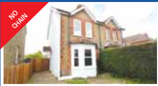
CATERHAM ON THE HILL £375,000 F/H A Victorian built three bedroom semi with two reception rooms, kitchen and utility room. The house requires MODERNISATION and has great potential to create an impressive family home. EPC: E Call 01883 348035 to book an appointment to view.