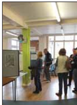
Visitors view the display at the exhibition.

Planning, who are working with the council to create the plan, said: "There is a lot of potential in Caterham and we are looking forward to getting the views of the community. We can then come back in the summer with more details of the key projects in the Masterplan." There will be a further consultation period in the summer before the final Masterplan is produced in the autumn, ready for approval by Tandridge District Council.